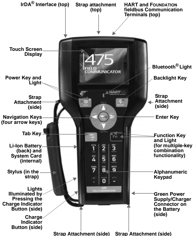
Figure 1. 475 Field Communicator