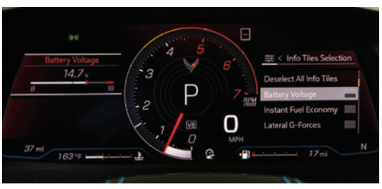
See Instruments and Controls in your Owner's Manual.