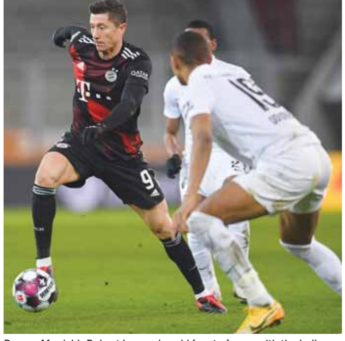
Bayern Munich's Robert Lewandowski (centre) runs with the ball during the Bundesliga match against Augsburg on Wednesday.

It was a different story after the break as Augsburg wasted a string of chances, including Finnbogason's miss after Benjamin Pavard handled in the area. The clean sheet in Augsburg saw Bayern goalkeeper Neuer equal