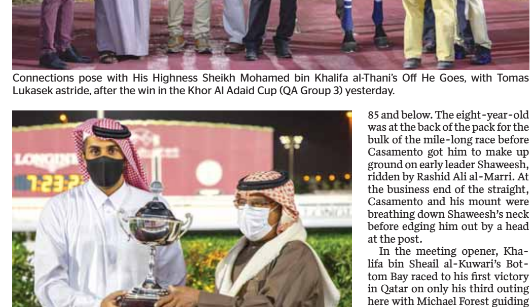
QREC Racing manager presents the owner's trophy after Al Wasmiyah Farm's Perfect Empire won the Thoroughbred Classic yesterday.