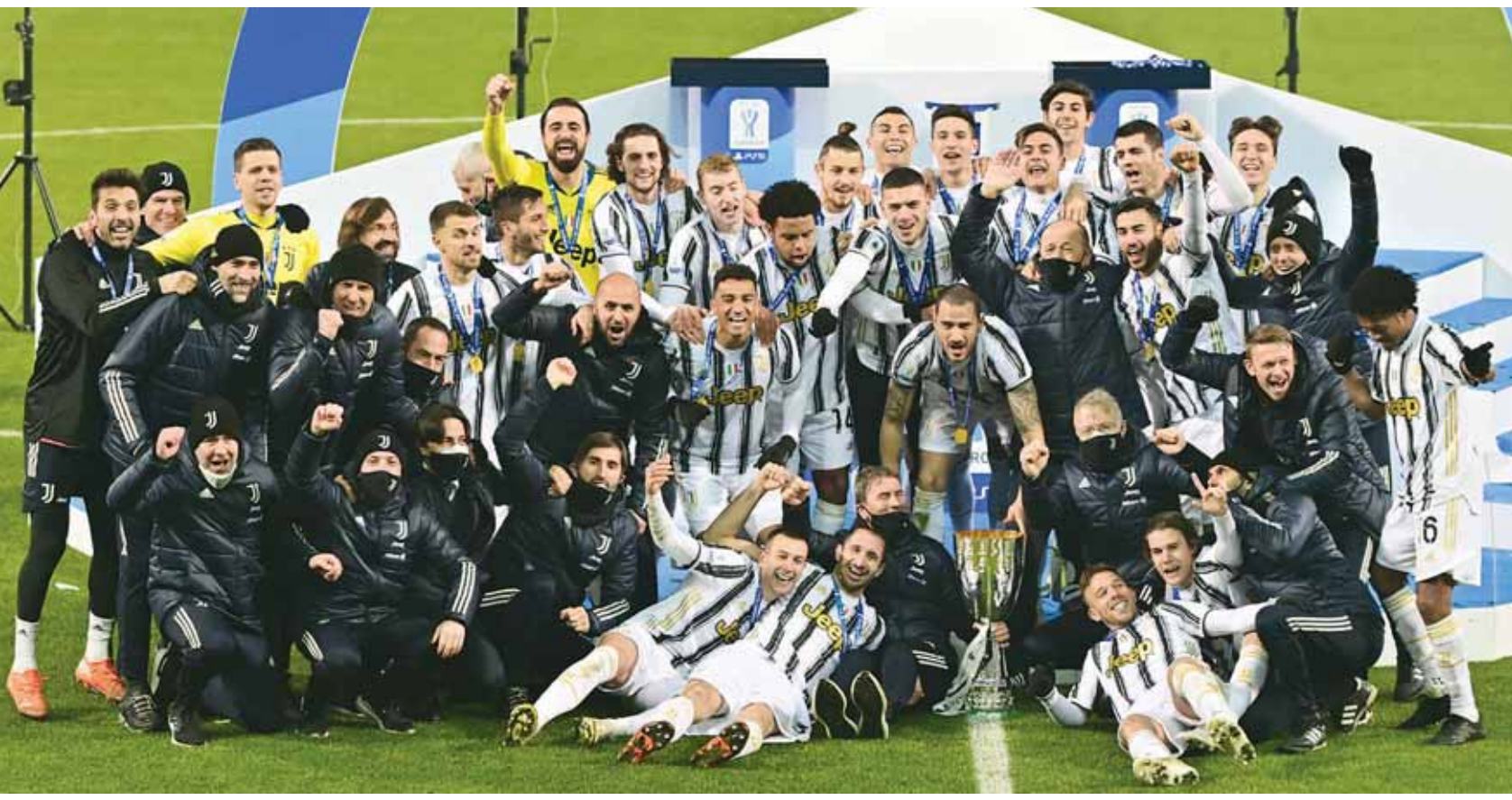
Juventus' players and staff celebrate with the trophy after winning the Italian Super Cup at the Mapei stadium in Reggio Emilia, Italy.

'Winning a first title (as a coach) is a great joy, different from that felt as a player'