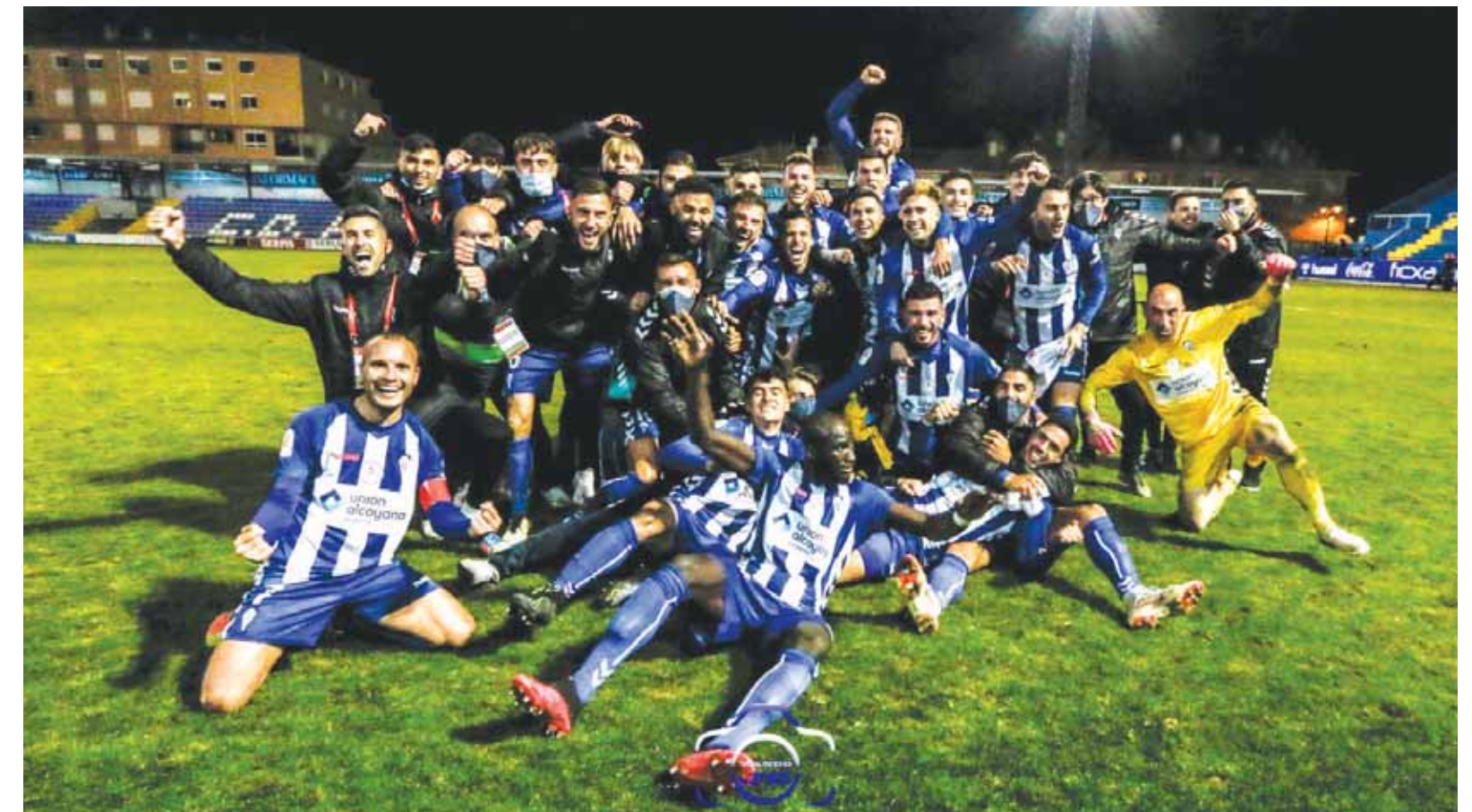
Third-tier side Alcoyano players celebrate after their win over Real Madrid in the Copa del Rey on Wednesday night.

flight since 1951 and their El Collao stadium holds less than 5,000 spectators. The only shame here was their fans were not able to see it.