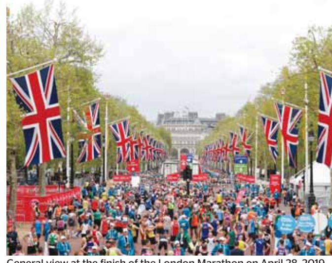
General view at the finish of the London Marathon on April 28, 2019

"We want to offer that again and we have also accelerated the plans we have been working on for some years to increase the number of finishers on the streets of London to 50,000," he added in a statement.