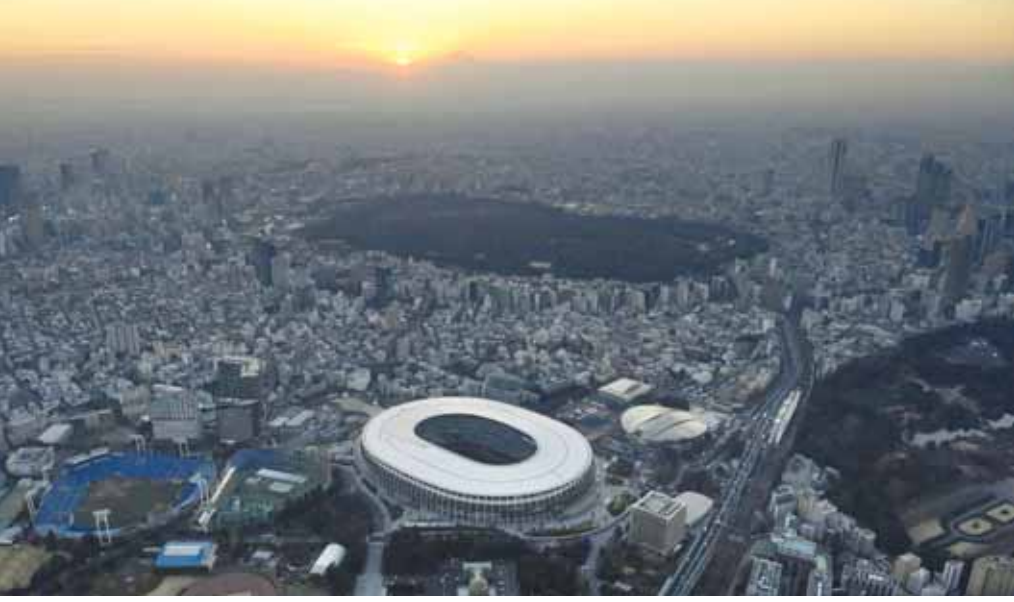
An aerial view shows the National Stadium, the main stadium of Tokyo 2020 Olympics and Paralympics, ahead of the six-months countdown to the Tokyo Olympics yesterday.

"It's been really eye-opening here in Melbourne to see and hear