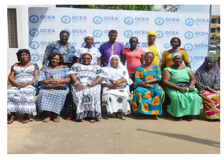
Market women invited to shed light on the sanitation situation in our markets.