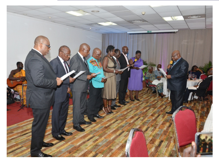
Swearing in of new Council at the dinner