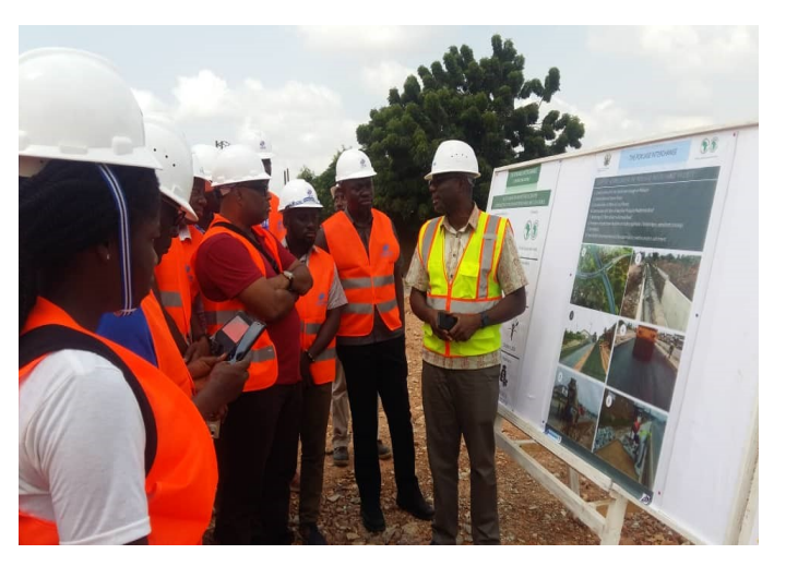
Delegates at the Pokuase Interchange under construction