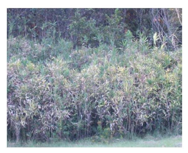
Figure 2. Stand of giant cane (Arundinaria gigantea). Photo taken on tribal lands of the Mississippi Band of Choctaw Indians, taken by Timothy Oakes, 2011.

hunting squirrels, rabbits, and various birds (Bushnell 1909; Hamel and Chiltoskey 1975; Speck 1941; Kniffen et al. 1987). Young Cherokee boys used giant cane blowguns armed with darts to protect ripening cornfields from scavenging birds and small mammals (Fogelson 2004). The Choctaw used the butt end of a cane, where the outside skin was thick, as a knife to cut meat, or as a weapon (Swanton 1931). Tribes of Louisiana made flutes, duck calls, and whistles out of cane (Kniffen et al. 1987). Cane is best harvested in the fall or winter (October to February) for blow guns and flutes, and plant stems, known as culms, are selected from mature, hardened off plants with larger diameters.