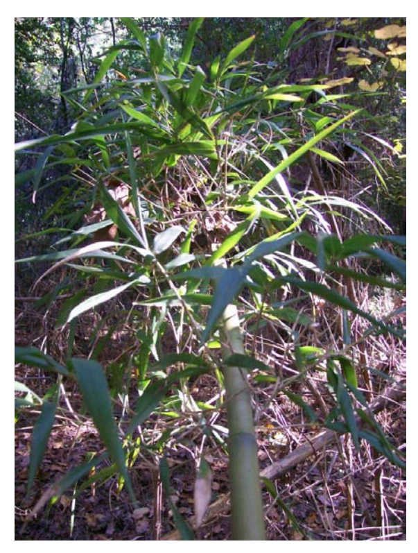
Figure 1. Giant cane (Arundinaria gigantea). Photo taken on tribal lands of the Mississippi Band of Choctaw Indians, taken by Tim Oakes, 2011.

Contributed by: USDA NRCS National Plants Data Team, Greensboro, NC