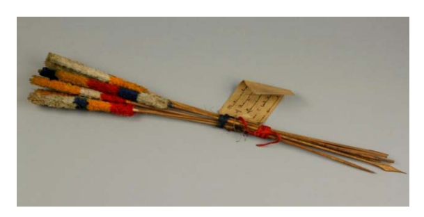
Figure 4. Chitimacha blowgun darts of fire-treated split cane. Courtesy of the Department of Anthropology, Smithsonian Institution F76807.

Young shoots were cooked as a potherb and ripe seeds were gathered in the summer or fall and ground into flour for food (Morton 1963; Hitchcock and Chase 1951). Flint (1828) says of a subspecies of giant cane, Arundinaria gigantea ssp. macrosperma : "It produces an abundant crop of seed with heads like those of broom corn. The seeds are farinaceous and are said to be not much inferior to wheat, for which the Indians and occasionally the first settlers substituted it." Giant cane also has medicinal properties. Both the Houma and the Seminole made a decoction of the roots: the Houma used it to stimulate the kidneys and renew strength, and the Seminole used it as a cathartic (Speck 1941; Sturtevant 1955 cited in Moerman 1998).