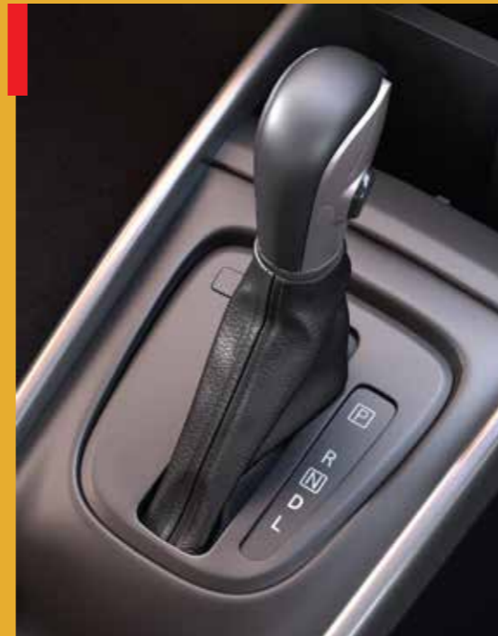
Seamless CVT/MT Transmission

The new Toyota Glanza is equipped with a powerful yet fuel efficient K-series engine that delivers a superior driving experience with exceptional power and low-end torque. Giving you all the thrills and performance you need to make your plans way more exciting.