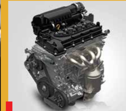
K-series Petrol Engine

The new Toyota Glanza is equipped with a powerful yet fuel efficient K-series engine that delivers a superior driving experience with exceptional power and low-end torque. Giving you all the thrills and performance you need to make your plans way more exciting.