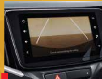
Reverse Parking Camera