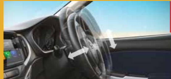
Tilt & Telescopic Steering with Steering Mounted Controls