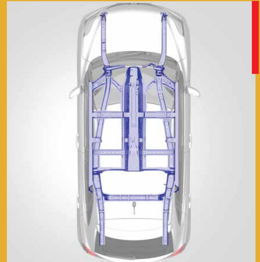
New Generation HEARTECT Platform - An innovative new platform designed to ensure superior crash resiliency, enhanced rigidity and improved NVH (Noise Vibration and Harshness) performance