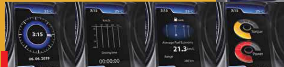
Interactive TFT Multi Info Display