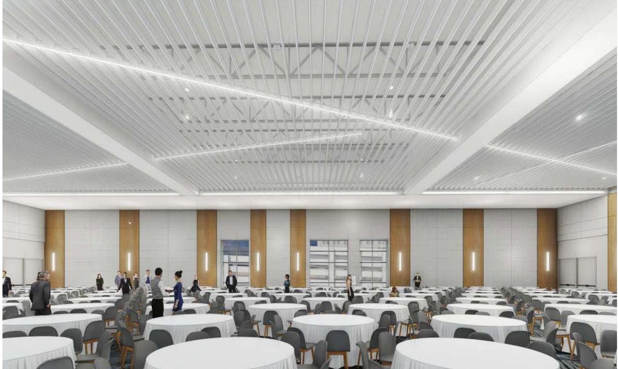
Ballroom View 1