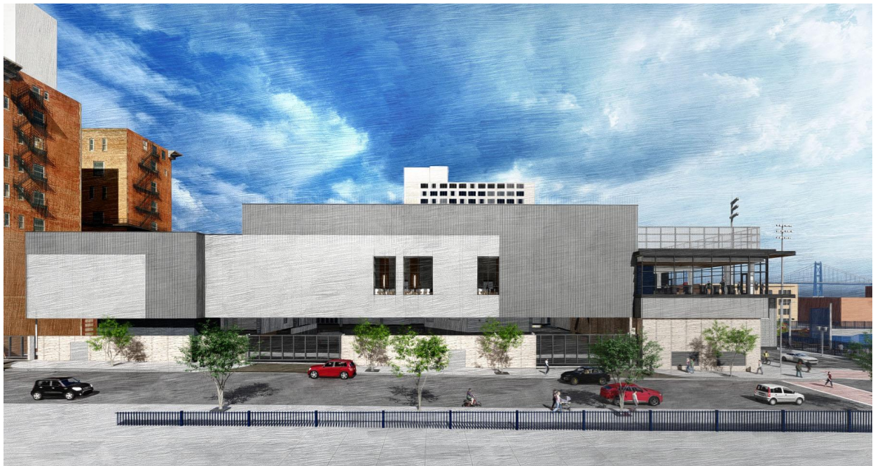
Superior Street Façade