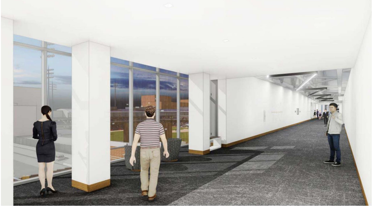
Monroe Street Concourse View 1