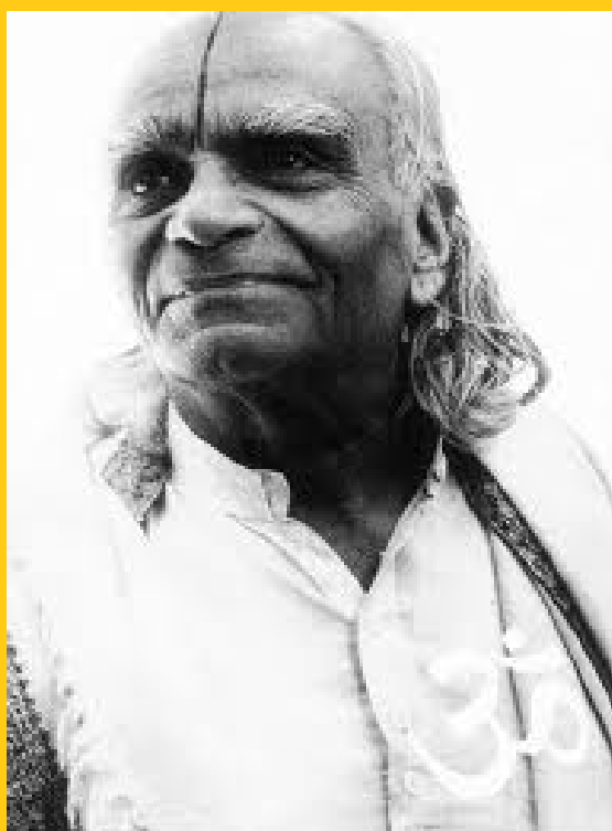
20 August: BKS Iyengar, 95