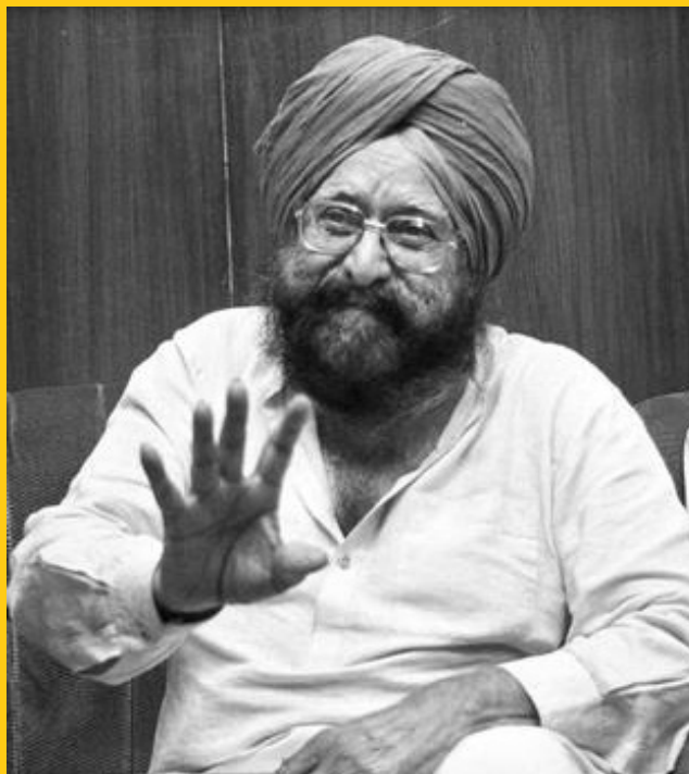
20 March: Khushwant Singh, 99