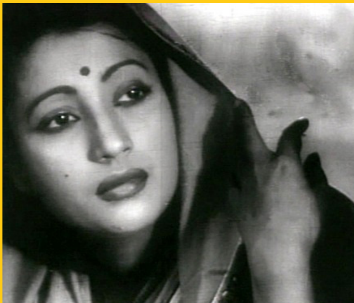
17 January: Suchitra Sen, 82