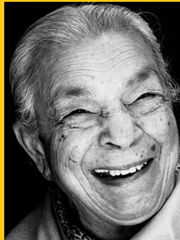
10 July: Zohra Sehgal, 102