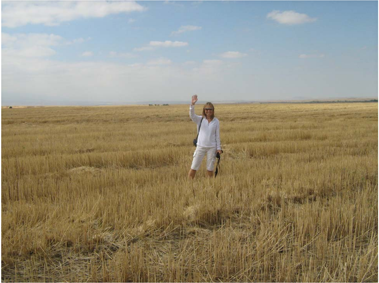
Figure 2 Author visiting a winter wheat field in Kazakhstan shortly after the harvest