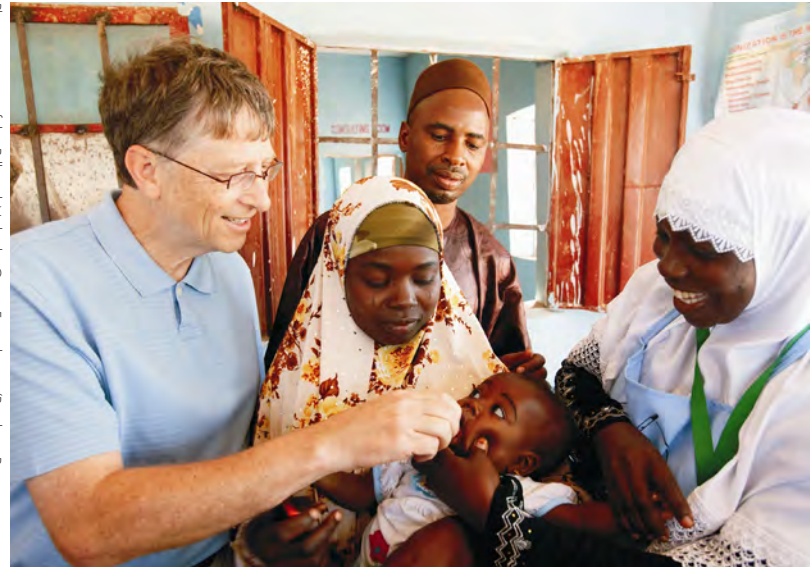
Bill Gates will visit NIH on Dec. 2 to meet with NIH leaders and give a speech on biomedical innovation.