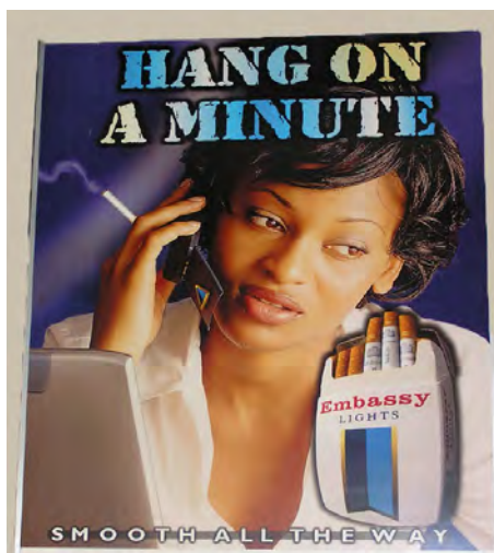
Tobacco use has been rising in developing countries, especially among women.