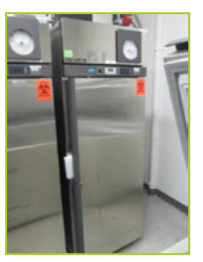
KENDRO LABORATORIES/ REVCO UGL2320A18 LAB FREEZER