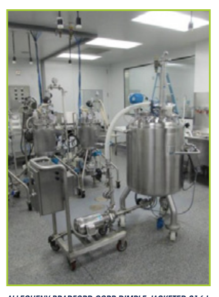
ALLEGHENY BRADFORD CORP. DIMPLE JACKETED 316 L STAINLESS STEEL 150 LITER CAPACITY BUFFER VESSEL