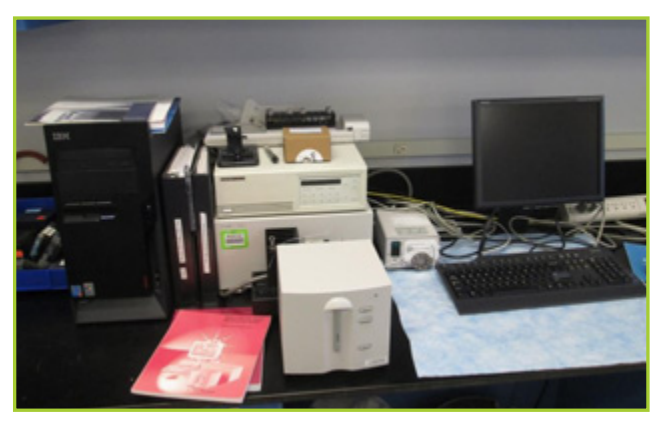
AGILENT 8453 UV-VISIBLE SPECTROSCOPY SYSTEM