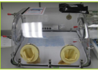
HOWDEN P123LG280/17 REGENERATION COMPRESSOR