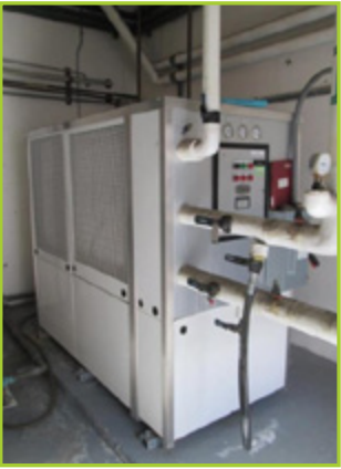
FILTRINE PCP-750S-98A CHILLER