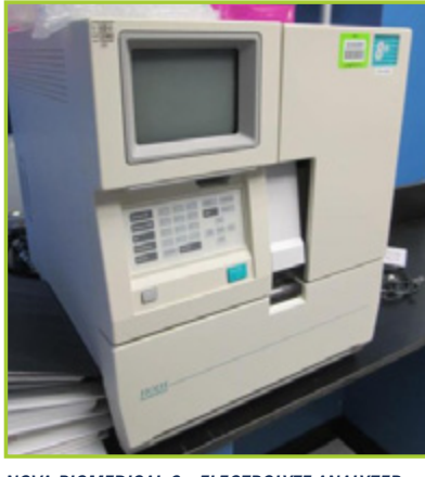
NOVA BIOMEDICAL 8+ ELECTROLYTE ANALYZER