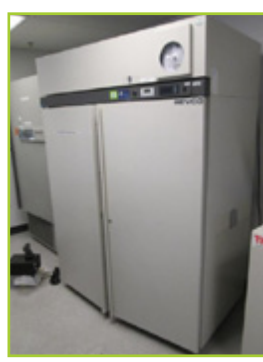
THERMO ELECTRON CORP. REL5004A21 LAB REFRIGERATOR