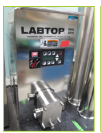
FLOWTECH 350 LAPTOP INTEGRATED PUMPING SYSTEM