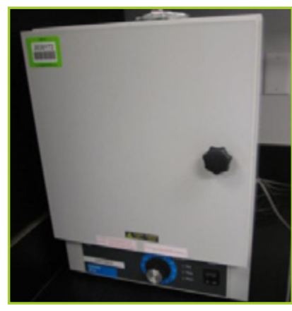
FISHER SCIENTIFIC 506G ISOTEMP OVEN