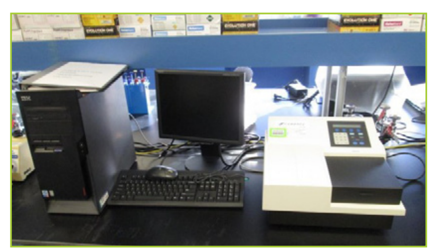
CAMBREX ELX 808 ABSORBANCE MICROPLATE READER WITH P.C.