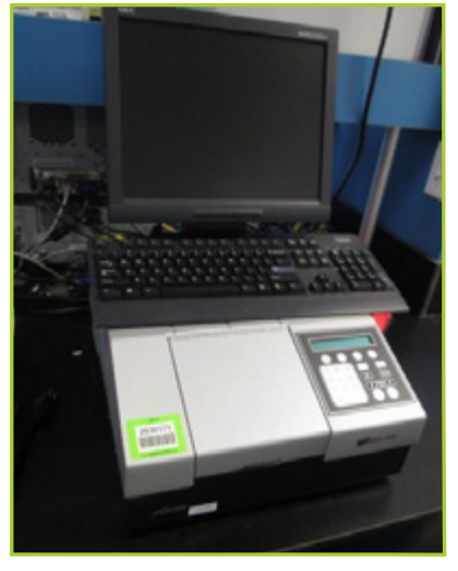
BIO-TEK UQUANT MICROPLATE READER