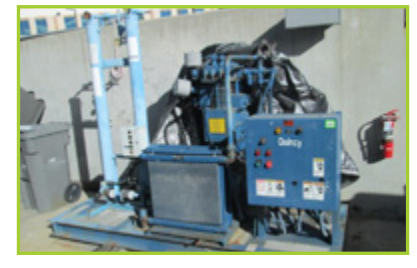
QUINCY AIR COMPRESSOR