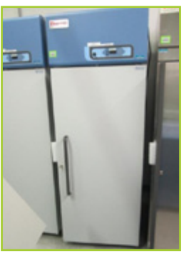
THERMO SCIENTIFIC/ REVCO UGL2320A20 LAB FREEZER