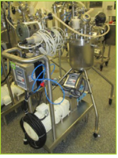
AMERICAN ALLOY JACKETED 80 PSI 16 LITER CAPACITY 316 L STAINLESS STEEL VESSEL WITH SPRAY BALL

1 - Filtrine PCP-750S-98A Chiller to include Log Book and Manual