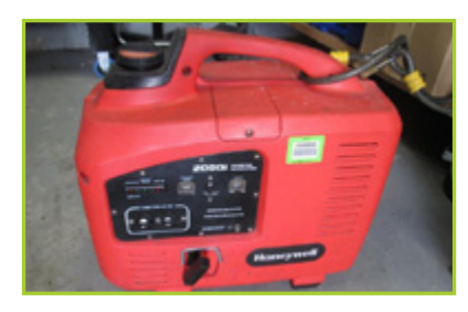
HONEYWELL 2000I INVERTER GENERATOR