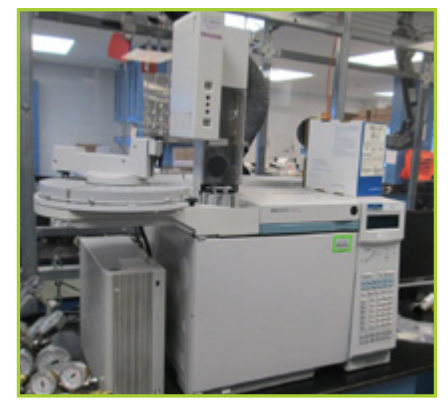
AGILENT 6890N GAS CHROMATOGRAPHY SYSTEM