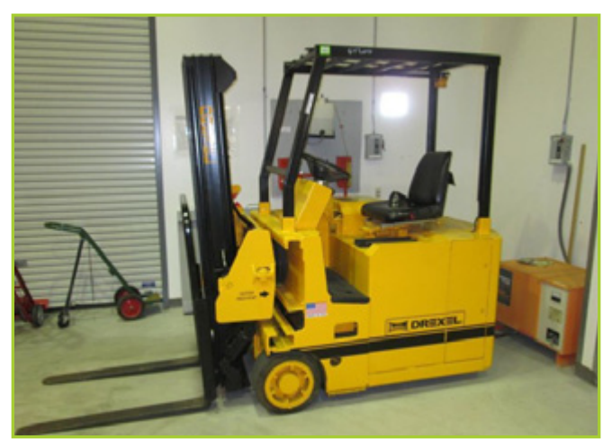
DREXEL SLT 22 ELECTRIC FORKLIFT TO INCLUDE CHARGER