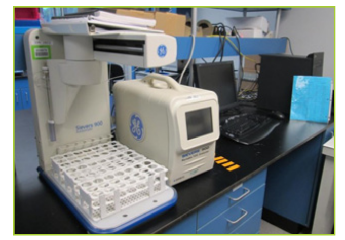
GEC GAS CONSOLE