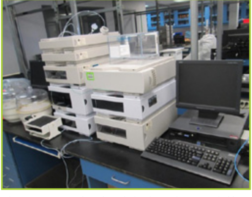
AGILENT 1100/1200 SERIES HPLC TO INCLUDE G1322A DEGASSER