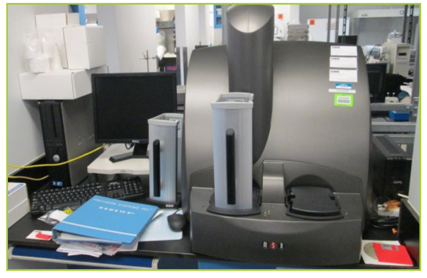
MESO SCALE DISCOVERY 1250 CHEMISTRY ANALYZER

STARTING: December 18, 2013 - 7:00 am ENDING: December 20, 2013 - 7:00 am PST