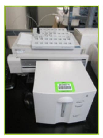
HEWLETT PACKARD 8453 UV-VISIBLE SPECTROSCOPE SYSTEM