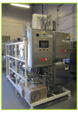
MECO 5MEF25 DISTILLATION UNIT