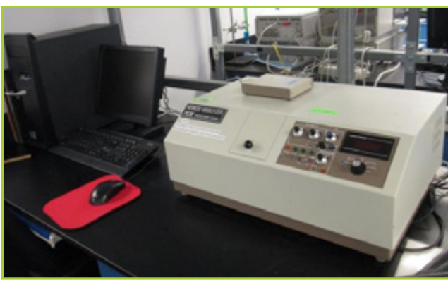
TCS SCIENTIFIC CORP. B HMOX-ANALYZER WITH HAS-200 AND P.C.