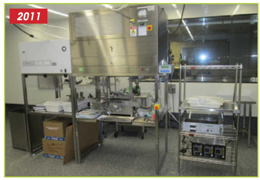
PLUMAT F-014-1-BFH SINGLE HEAD FILLER, MFG. 2011