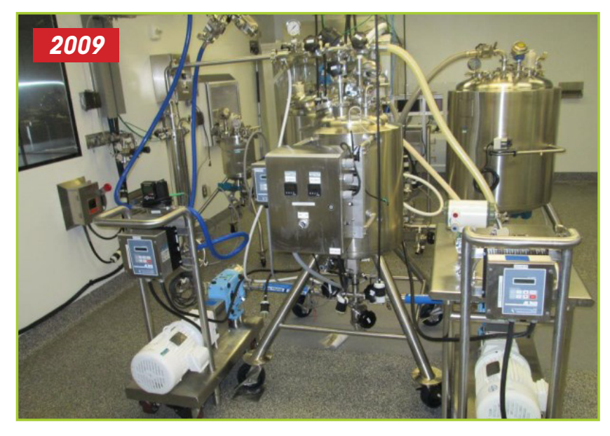
FELDMEIER EQUIPMENT INC. REACTION TANK, 316 L STAINLESS STEEL, DIMPLE JACKETED MFG. 2009

6 - BioCold Stability Series Chamber to include Munters Type MG90 Dry Box