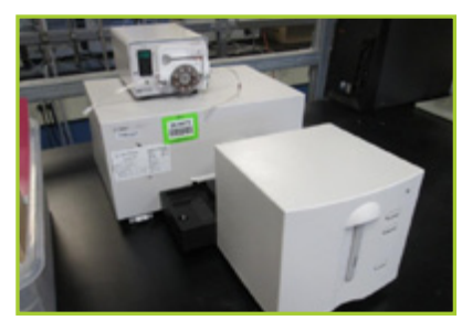
AGILENT 8453 UV-VISIBLE SPECTROSCOPE

1 – Buchi Rotavapor Rotavapor to include R-205, V-800 Vacuum Controller, B-490 Heating Bath, V-500 Vac, and Glassware