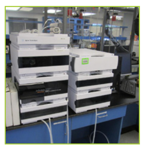
AGILENT 1260 INFINITY HPLC