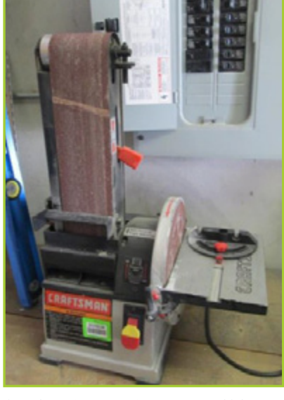
CRAFTSMAN 351.22 4 X 8 IN BELT AND DISC SANDER