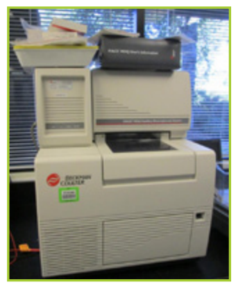
BECKMAN COULTER P/ACE MDQ CAPILLARY ELECTROPHORESIS SYSTEM

1 - Plumat Bag Testing Device, mfg. 2006