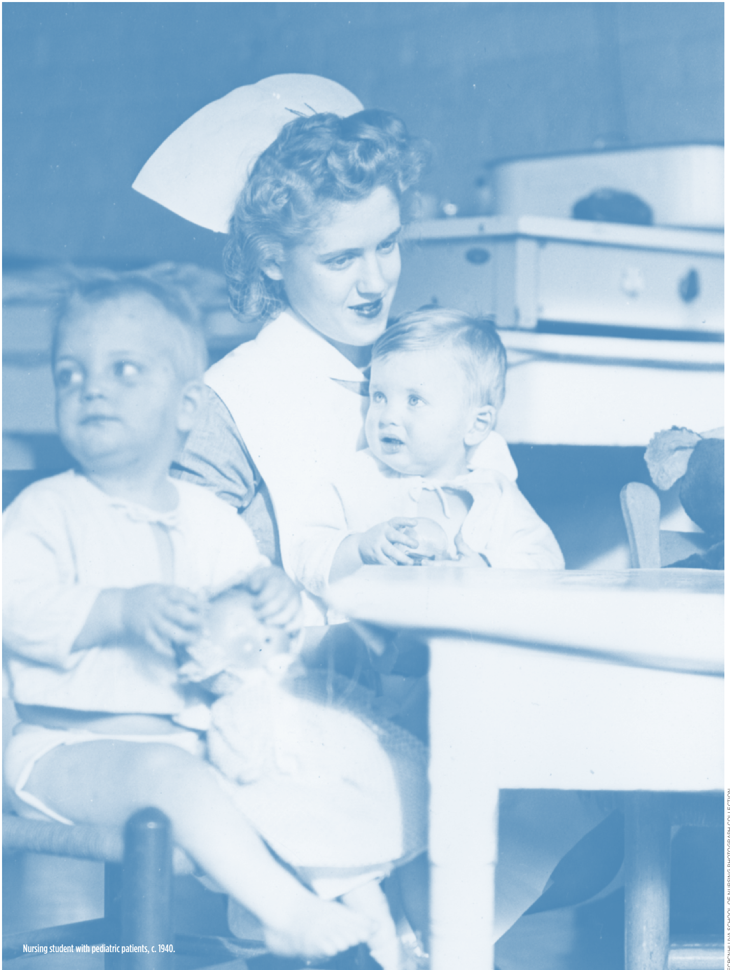
Nursing student with pediatric patients, c. 1940.