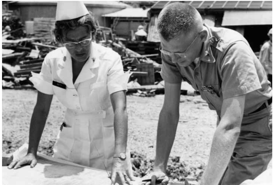
Colleagues in Korea c. 1955.