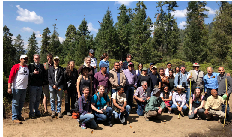
The Trinational Monarch Conservation Science Partnership meeting in El Rosario, Mexico in March of 2018. Photo taken at butterfly reserve.