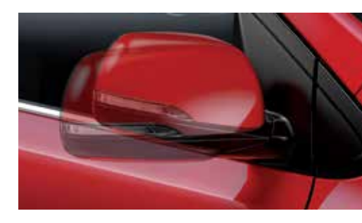
Electric Folding Side Mirrors **

Enjoy a more luxurious look with body-colour side mirrors that are available with side mirror indicators and heating function.