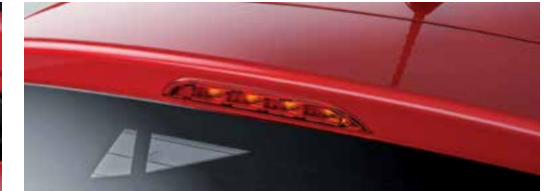
High-mounted Stop Lamp

In extremely tight situations, a handy one-touch mechanism folds and unfolds the mirrors to facilitate safe passage.