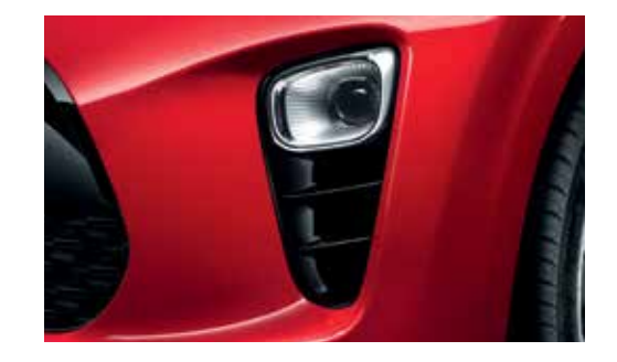
Projection Fog Lamps**