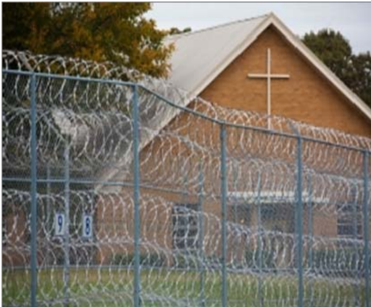
Lee Arrendale State Prison Chapel Alto, Georgia

When the talks were given on the Weekend, the participants sat riveted at the testimonies they heard. By becoming transparent and allowing God to shine through their pain, the Inside team opened the door for the young women to share deeply. I have never heard more powerful talks on a Weekend. I learned how truly deep their faith is.