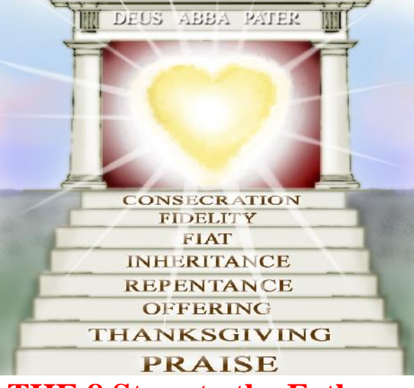
THE 8 Steps to the Father THEMES FOR THE 8 DAYS --- STARTING with the 1<sup>st</sup> Day PRAISE – And ending on the 8<sup>th</sup> Day CONSECRATION.