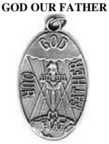
THE ALPHA & THE OMEGA