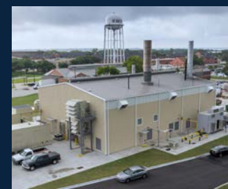
CTC has supported several military branches with their energy requirements. The new heat and power plant at Marine Corps Recruit Depot Parris Island is a prime example of the Marine Corps commitment to energy efficiency.

CTC plays a key role in ensuring the energy efficiency, resilience, and reliability at all Marine Corps installations worldwide. The U.S. Marine Corps Installations Command (MCICOM) awarded CTC a contract worth up to $36 million to address utility distribution systems that support the the Marine Corps energy reliability and resilience requirements. As the prime contractor, CTC has completed the base year and has started on the first option year on that contract. The work includes CTC and several small business subcontractors identifying potential infrastructure upgrades, conducting energy audits, analyzing mission assurance assessments, and developing solutions to fix gaps identified by those assessments.