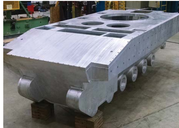
OPSEC SOP #29698