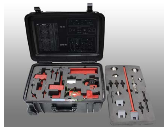
EVC's H-60 Bridge Tool Deluxe Kit (left) is designed for the removal and installation of H-60 and S-70 aircraft forward and aft bridge assembly components. The Quick Skive Removal Tools (right) are used to remove sealants, fillers, and specialty materials from surfaces without damaging substrates or primer coatings.