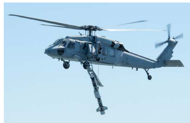
The Carriage, Stream, Tow, and Recovery System (CSTRS) was designed to support the U.S. Navy's requirement to provide an organic airborne mine countermeasure capability from an H-60 helicopter. 170316-N-PB086-215

In 2012, EVC created a production services group to continue the development and commercialization of CSTRS. EVC became the original equipment manufacturer of CSTRS, handling all equipment manufacturing, testing, and sustainment for CSTRS. Working in accordance with the AS9100 standard, EVC provides full lifecycle management, including pre-production manufacturing engineering, product manufacturing, and sustainment activities such as spare parts manufacture, repair services, and training.