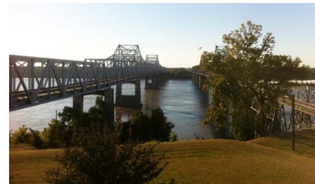
CTC has developed novel technology to monitor the structural health of steel bridges, including a camera system that allows for remote viewing of the entire structure and the main navigation channel.

The U.S. Army Corps of Engineers published the results of a CTC-managed project that introduced novel technology to monitor steel bridges. The Research and Development Center Construction Engineering Research Laboratory final report details the structural health monitoring system, which is recommended for use on bridges critical for DoD use. The system monitors corrosion using several types of sensors and monitoring systems that transmit data and alerts via web-connected computers. Not only can the system remotely monitor bridges' structural integrity, it can deliver advanced warning of a growing structural problem, providing the ability to repair it before catastrophic failure.