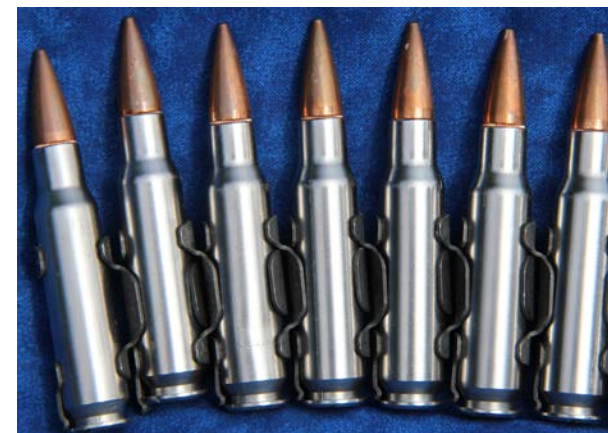
Building on years of ammunition process engineering solutions, CTC's current focus is on alternative metallic case design for next-generation small caliber ammunition, which provides significant improvements over conventional ammunition.

Both the Department of Defense and the commercial industry can benefit from CTC's award-winning approach to manufacturing ammunition. The National Armaments Consortium (NAC) and the DoD Ordnance Technology Consortium (DOTC) recognized CTC for Outstanding Technical Achievement for its innovative manufacturing process that improves logistics and the end product. CTC is developing and testing prototype ammunition cases that simplify the manufacturing process, reduce the total cost of ownership and manufacturing footprint, increase performance, and reduce weight. This work is building on decades of experience developing industry-leading environmental and process engineering solutions that cover research and development through testing, technology transition, and implementation.