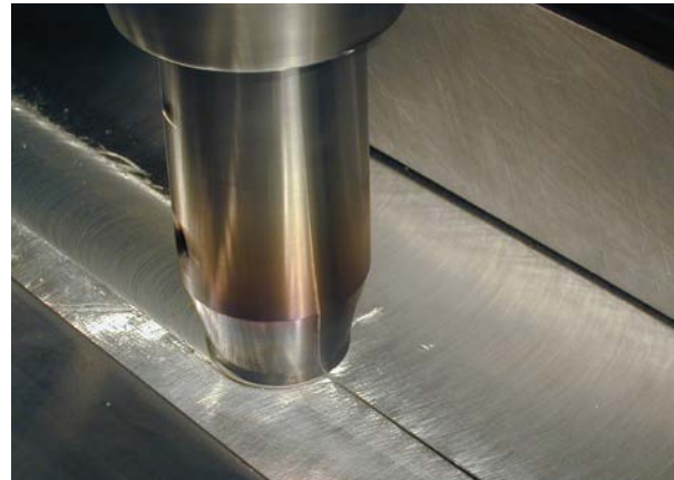
CTC has a long history of creating advancements in engineering and manufacturing, including innovations in friction stir welding, which are being leveraged in a project to manufacture armored vehicle prototype hulls for the U.S. military.