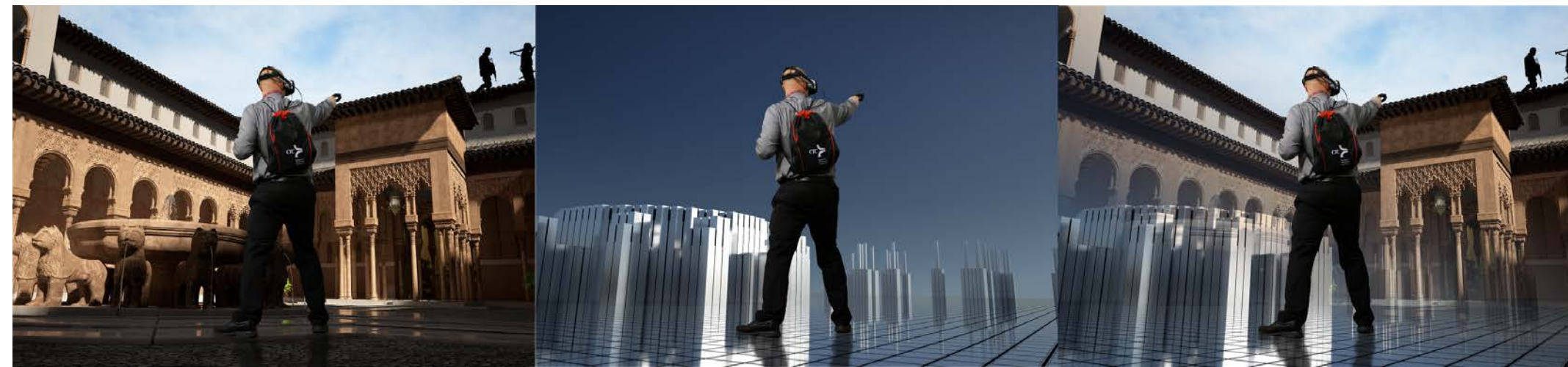
PolyFormXR automates the construction of synthetic physical infrastructure, such as walls, windows, doorways, stairs, and large props, for urban combat training.

Links to the items listed above are included in digital version of the Annual Report at ctc.com .