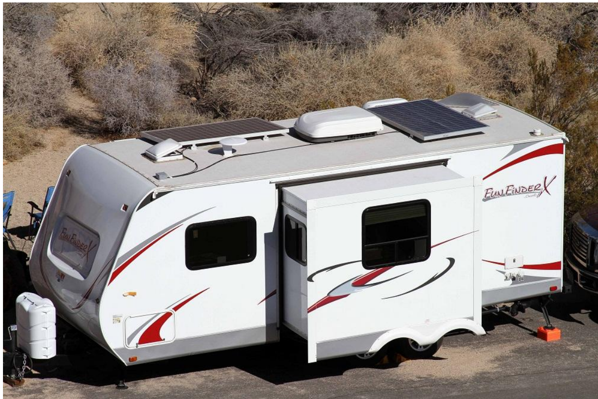
FunFinder roof view in Joshua Tree NP

Ah, we were off to a good start. We went back and forth until I had it right. This is the result: