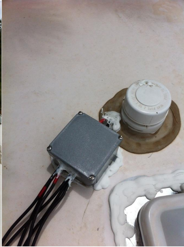
Roof Junction Box

Choosing this route reduced the cable length from the junction box to the charge controller in the battery compartment by more than eight feet. Short runs with the proper size wire are crucial to a good install. The distance from the junction box to the farthest panel is about 20' of #10. The distance from the junction box to the charge controller is about 13' of #6. Wire losses are minimal in my implementation.