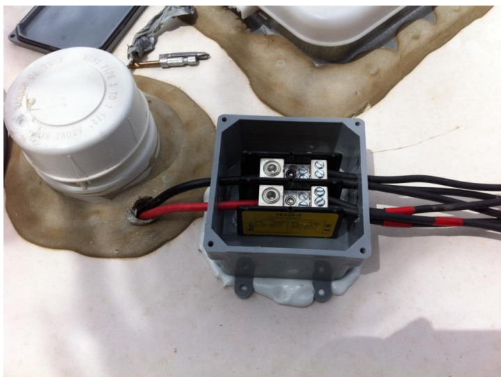
Roof Junction Box

Choosing this route reduced the cable length from the junction box to the charge controller in the battery compartment by more than eight feet. Short runs with the proper size wire are crucial to a good install. The distance from the junction box to the farthest panel is about 20' of #10. The distance from the junction box to the charge controller is about 13' of #6. Wire losses are minimal in my implementation.