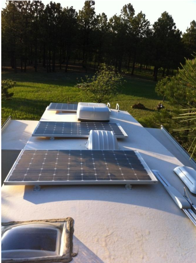
Roof view of Panels

In some respects this install was easier as well. Unlike on the FunFinder I had plenty of roof real estate to carry the three full sized panels. There is room for a fourth panel if I want to add one. But I don’t really foresee needing 1000W! Besides four panels would deliver more current than the CC can handle.