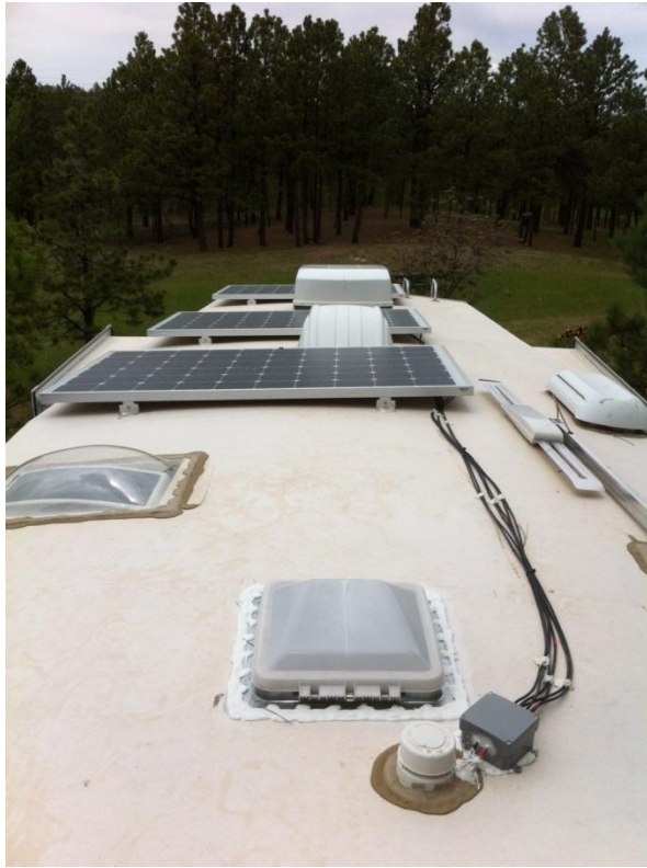
Roof view including wiring