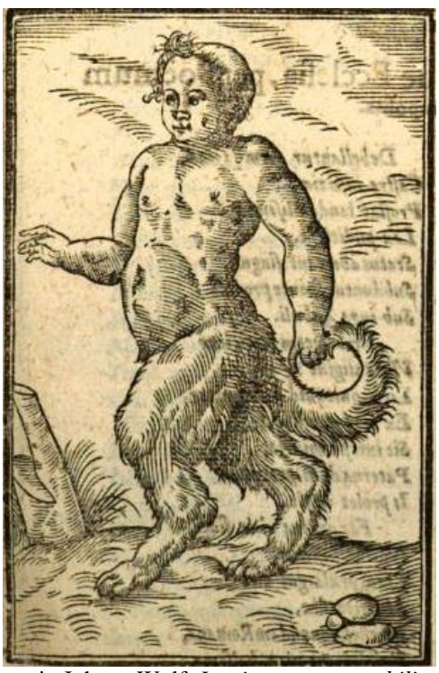
Fig. 7. Artist Unknown in Johann Wolf, Lectionum memorabilium and econditarum , Lauingen, 1600, 911, Woodcut.

functioned as a reminder of the sin it was conceived in. As stated in Leviticus 18.23, bestiality was a sin. The depravity of mixing species was further indicated in Leviticus 19.19: 'Do not mate different kinds of animals. Do not plant your field with two kinds of seeds'. This doctrine was used to highlight that animals were quantifiably different from humans by defining Christian sexuality within the strict hierarchical system of man and beast (Salisbury 1994, 87-88).