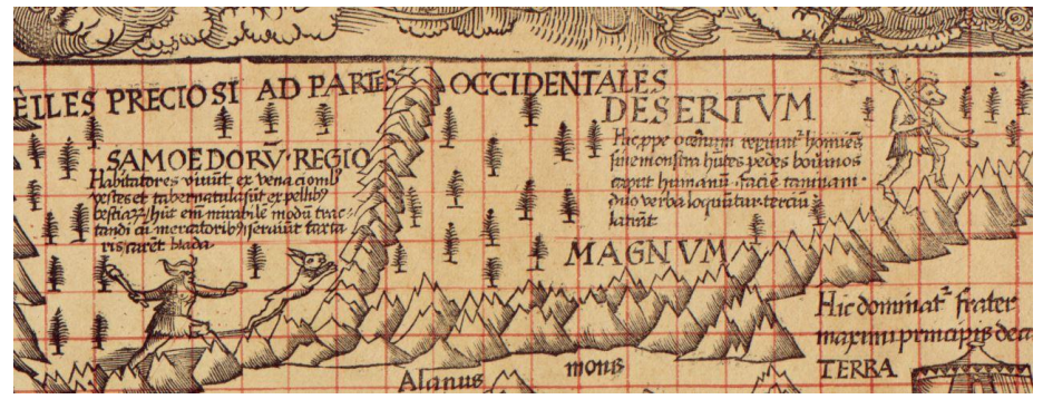
Fig. 1. Martin Waldseemüller, Carta marina navigatoria portugallen [siorum] navigationes atque totius cogniti orbis terre marisque formam naturamque situs et terminos nostri[s] temporibus recognitos et ab antiquorum traditione differentes eciam quorum vetusti non meminuerunt autores, hec generaliter indicat, Detail, 1516, Strasbourg, produced by Johann Schott. Woodcut, 128 x 233 cm, each sheet measures 45.5 x 62 cm, Library of Congress, Washington DC, Jay I. Kislak Collection.

motif was used to further symbolise the creatures' barbarity and ignorance of more sophisticated chivalric weapons (Friedman 1981, 32-33).