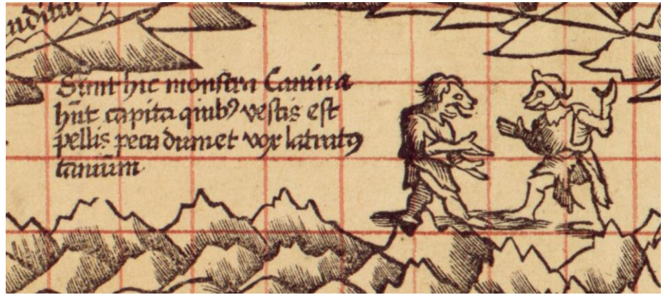
Fig. 3. Martin Waldseemüller, Carta marina navigatoria portugallen [siorum] navigationes atque totius cogniti orbis terre marisque formam naturamque situs et terminos nostri[s] temporibus recognitos et ab antiquorum traditione differentes eciam quorum vetusti non meminuerunt autores, hec generaliter indicat, Detail, 1516, Strasbourg, produced by Johann Schott. Woodcut, 128 x 233 cm, each sheet measures 45.5 x 62 cm, Library of Congress, Washington DC, Jay I. Kislak Collection.

cynocephalus on the left is open revealing its long protruding canine tongue. Both are gesturing heavily with their hands raised to signify their lack of sophisticated language. They are further distinguished from the previous cynocephalus with hooved feet above as the text beside them notes that they rely exclusively on barking to communicate (Duzer 2010, 228). This is emphasised with the cynocephalus on the right with his hands raised in an apparent frustrated attempt to communicate.