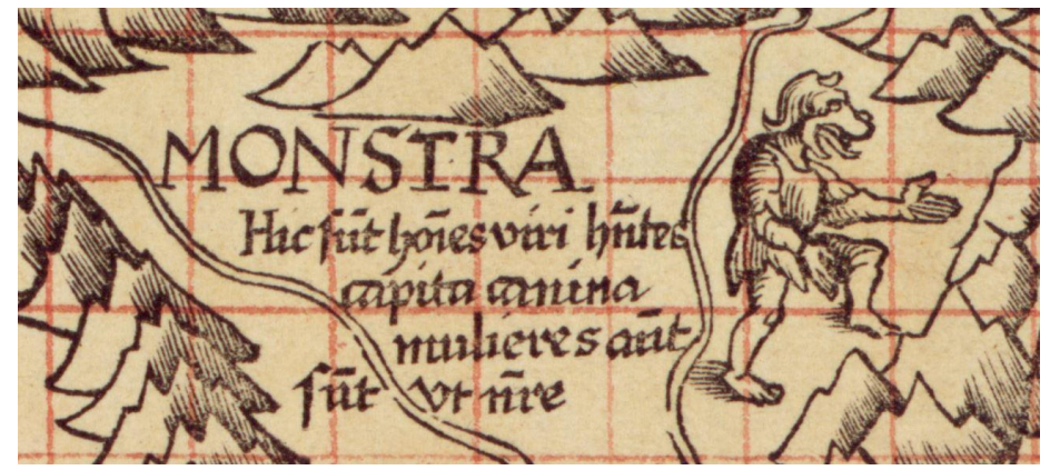
Fig. 4. Martin Waldseemüller, Carta marina navigatoria portugallen [siorum] navigationes atque totius cogniti orbis terre marisque formam naturamque situs et terminos nostri[s] temporibus recognitos et ab antiquorum traditione differentes eciam quorum vetusti non meminuerunt autores, hec generaliter indicat, Detail, 1516, Strasbourg, produced by Johann Schott. Woodcut, 128 x 233 cm, each sheet measures 45.5 x 62 cm, Library of Congress, Washington DC, Jay I. Kislak Collection.

Adam of Bremen, a German historian of the eleventh century, described the birth of cynocephali from the Amazon women of Asia, considered a monstrous race in themselves. In his historical treatise, Gesta Hammaburgensis ecclesiae pontificum ('History of the Archbishops of Hamburg-Bremen'), he writes: