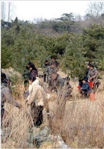
Back Cover: A mass drive is under way to plant trees