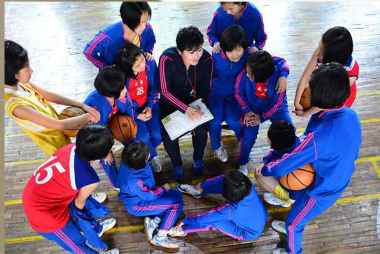
A tactical discussion is under way.

I WENT TO THE PYONG-lyang Indoor Stadium to see a women's basketball match, one of the events of the National Inter-Provincial Games 2018. The event was for basketball circles of juvenile sports schools in the country.