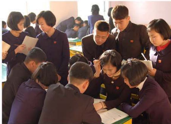
Problems are solved by study groups.