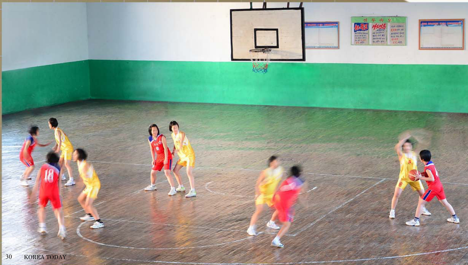
Training focuses on helping players improve teamwork.

Her effort bore fruit. She solved the problem of teamwork of the circle members and making them act in concert with one another. This led to their wins in matches. □