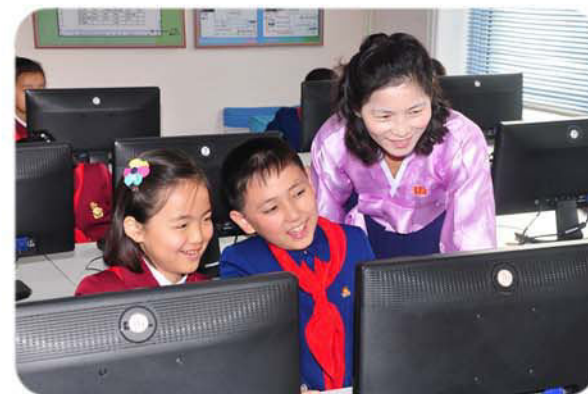
A new teaching method helps students improve their power of cognition.

I racked my brains to make the game interesting lest the students should find it boring. It took five hours to make the two- or three-minute game. I did not have the day off, but I felt no fatigue at the thought of the students who would be happy to play it.