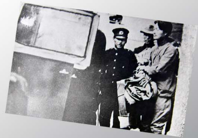
The Japanese imperialists brutally oppressed and killed the participants in the March First Popular Uprising.