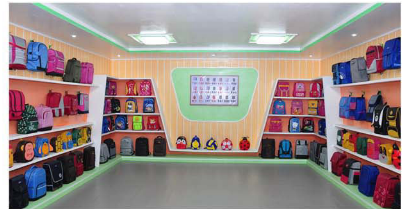
A backpack sample room.