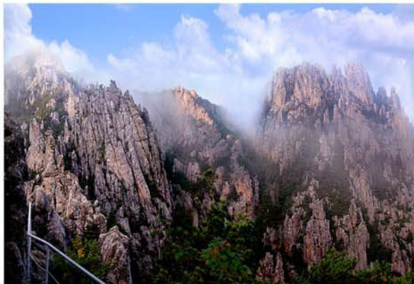
Fantastic rocks in Mt Kumgang.