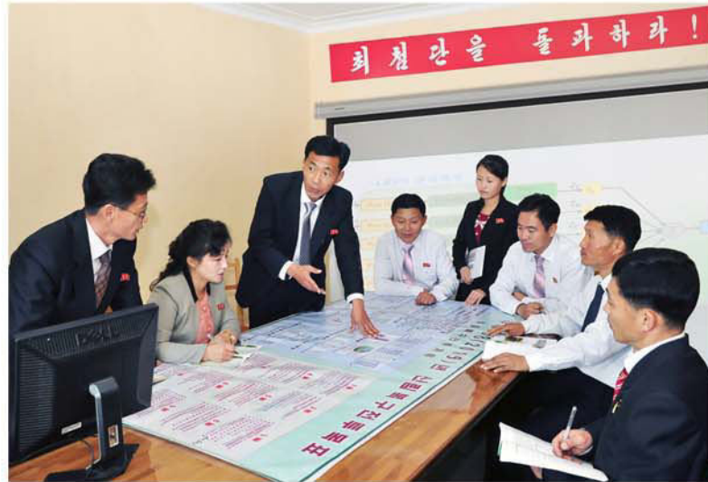
They discuss how to attain the goal of the forest restoration campaign.

SINCE ITS ESTABLISHMENT in December 1948 the Central Forest Design and Technology Institute has actively conducted the work of establishing a nationwide