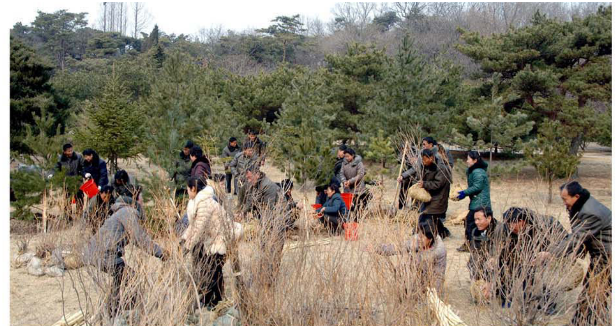
A mass drive is on to plant trees.

Amidst collective zeal for emulation, North and South Hwanghae and North and South Phyongan provinces briskly conducted a drive to overtake one another, learn from each other and exchange experience, thus planting trees in a wider area than planned and in a qualitative way and thoroughly ensuring the rate of their rooting.