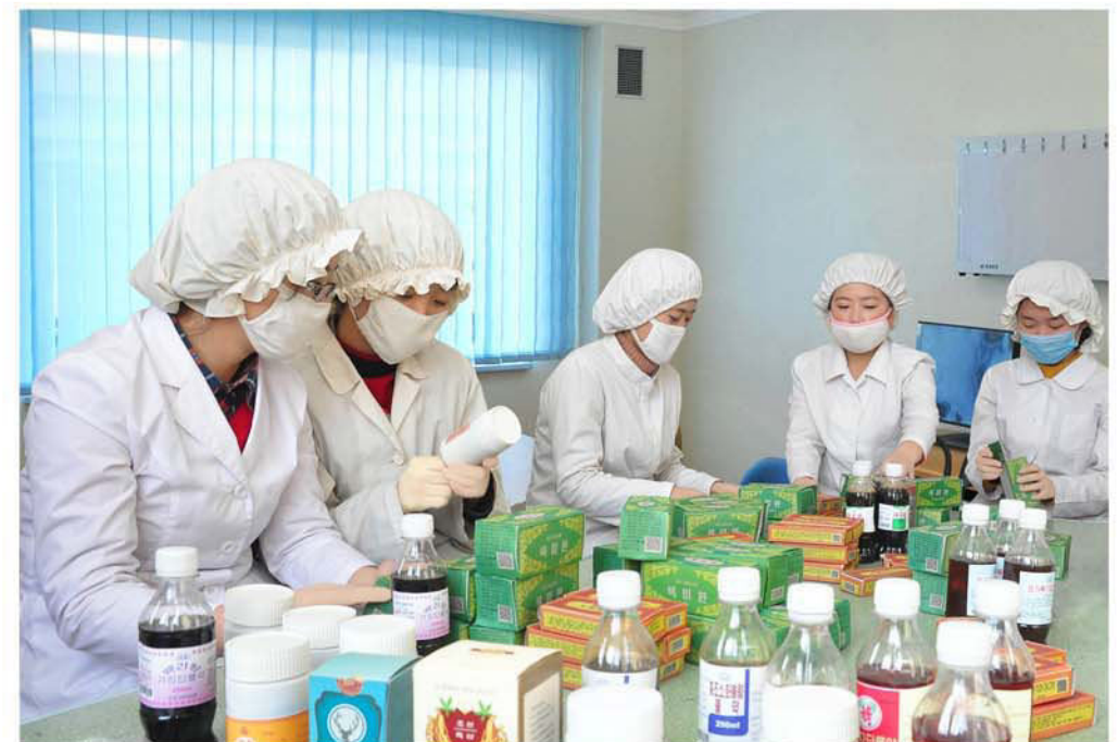
Medicines are packaged.