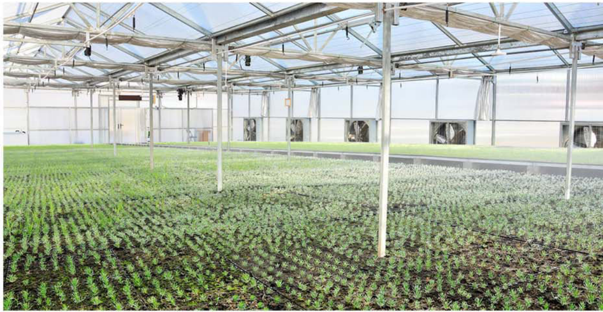
The interior of a plastic panel greenhouse.