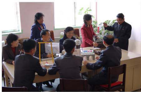
A discussion on teaching aids.