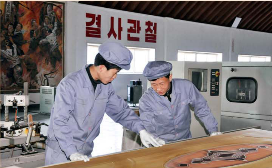
Light-burned magnesia goods are under production.

because they emit anions, and are fire- and moisture-proof, highly strong, hard, and highly resistant to noise and erosion. As it absorbs carbonic acid gas in the air, the application of light-burned magnesia products in dwellings is as good as having several trees inside the home.