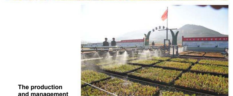
The production and management of saplings are under way in a far-sighted way.