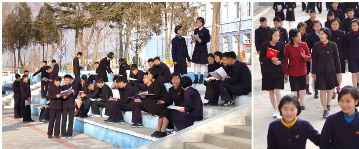
Students work hard and live in a proper manner as the heroes did.

T ODAY THE HERO Sukchon Senior Middle School in Sukchon County is recognized as a school of excellent academic performance not only in the county but also in South Phyongan Province.