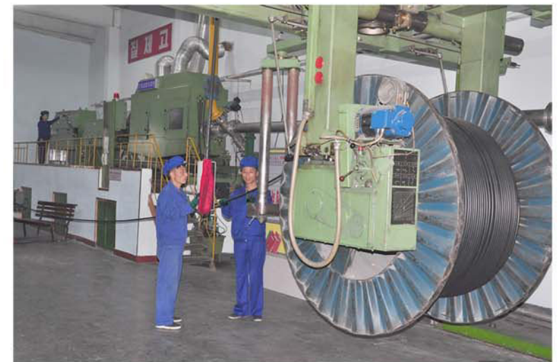
The production process of cross-linked polyethylene insulated power cable.