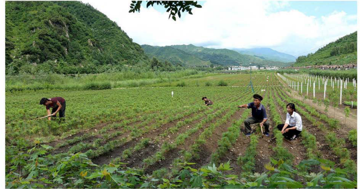
The production of saplings is on the increase at tree nurseries created to suit the actual conditions of the localities.

Besides, public interest in the conservation of forests led to the invention and introduction of good methods for solving decisively the problem of fuel without relying on wood. The Rajin District Fuel Company, on the basis of its experience in making effective use of various waste to solve the problem of fuel, doubled the