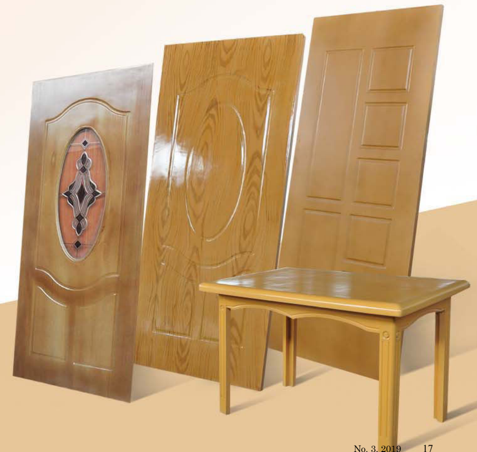
Some of the goods.

A typical product is light-burned magnesia shutterings. According to the verification by the builders who erected the