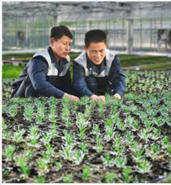
Front Cover: Saplings are tended well at the Mundok County Forest Management Station in South Phyongan Province