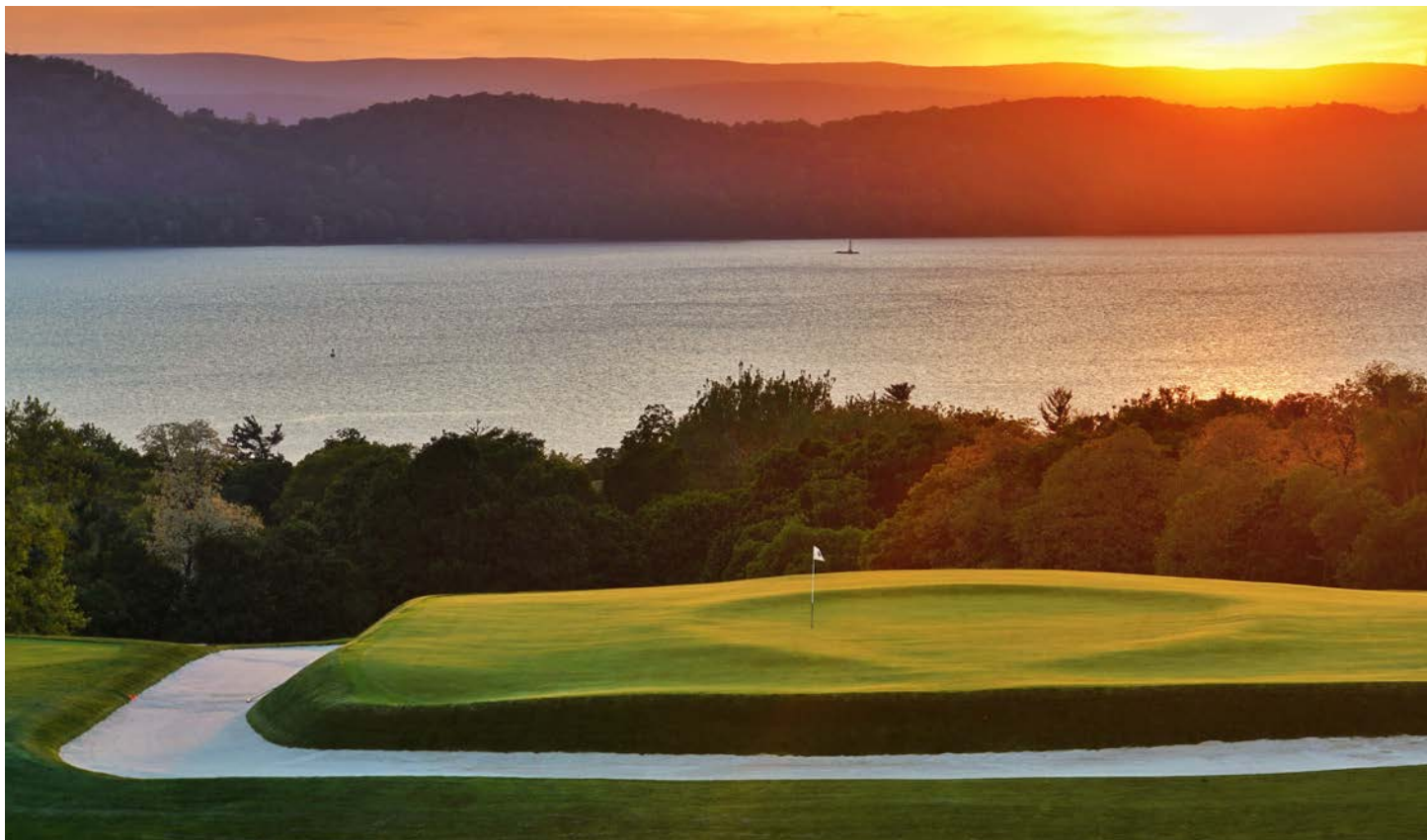
NO. 89 : SLEEPY HOLLOW : 16TH HOLE