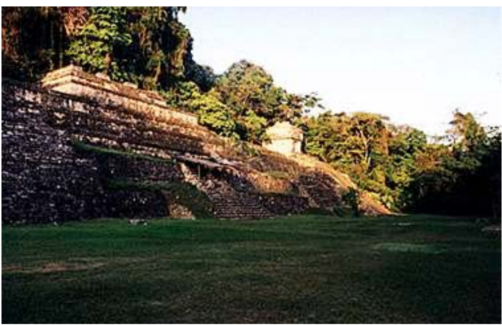
The Temple of the Red Queen, Temple XII-A and the Temple of the Skull.

In the course of the work, we were able to recover archaeological information in the sector, notably the discovery of a tomb inside Temple XIII. This tomb comprises a sarcophagus placed inside a mortuary chamber within an architectural complex of large dimensions and great quality of execution. It can be considered as one of the richest ever found, exceeded only perhaps by the one in the Temple of the Inscriptions. The building is now popularly known as the Temple of the Red Queen, on account of the tomb and the red cinnabar covering its occupant.