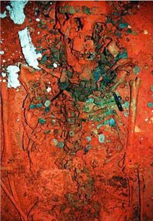
The Red Queen.

The sarcophagus was painted red through the use of cinnabar, and it was carved in one single piece. On top of it lay a monolithic limestone slab 2.40 meters long, 1.18 meters wide and 10 centimeters thick. Standing roughly at the center of the slab was a lidded censer, and at the foot of this censer lay a small bone spindle whorl.