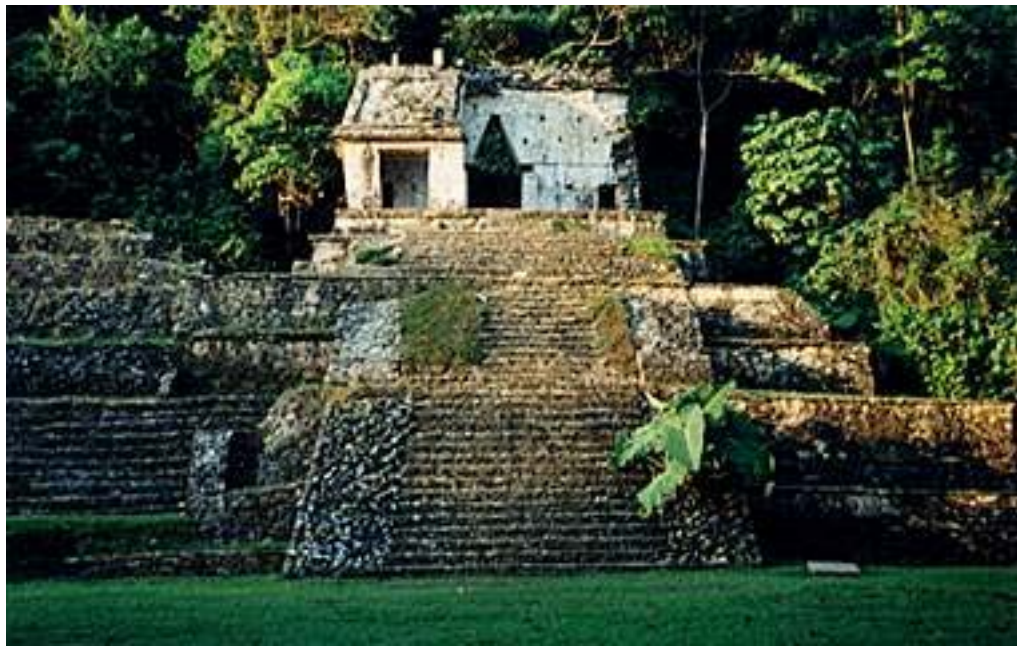
The Temple of the Skull .

Beginning with the 1993 field season, we concentrated our efforts on the Great Plaza, where we carried out conservation work both in the Temple of the Inscriptions and in the Palace. During the 1994 field season, we carried out the exploration and restoration of the Temple of the Skull, Temple XII-A and Temple XIII.