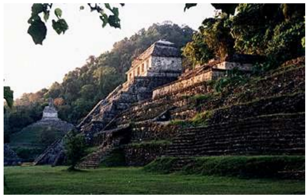
The Temple of the Cross, the Temple of the Inscriptions, Temple XIII (the Temple of the Red Queen) and Temple XII-A.

Beginning with the 1993 field season, we concentrated our efforts on the Great Plaza, where we carried out conservation work both in the Temple of the Inscriptions and in the Palace. During the 1994 field season, we carried out the exploration and restoration of the Temple of the Skull, Temple XII-A and Temple XIII.