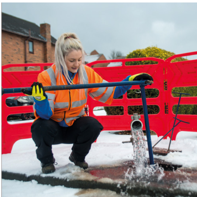
Northumbrian Water employee at work

schools need from an employer, what works and what doesn't. I also wanted to learn how to achieve better long-term outcomes when we welcome those with different needs into our workplace.