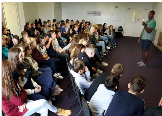
External speaker working with students from St Joseph's Catholic Academy

In our sixth form we have a student whose goal has always been to go to university. Due to her physical disability she uses a wheelchair, and is unable to write or carry out many tasks other students take for granted. She had always attended specialist provision but during her GCSE years she was proactive in getting in touch with local schools that could offer A-levels. However, although she had no learning difficulties, there was a clear gap in provision in our local area for students with these types of physical disability. I felt that we could meet the needs of this student,