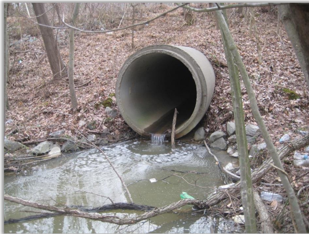
Photo 1. This manual aims to prevent pollutants from entering stormwater conveyances and, ultimately, receiving waters.

The written procedures herein serve as the foundation of a successful Good Housekeeping/Pollution Prevention Program that helps CSH achieve MS4 Permit compliance. Implementation and documentation of the procedures are critical for achieving the Good Housekeeping/Pollution Prevention Program goal to eliminate non-stormwater discharges to CSH's storm sewer system and, ultimately, receiving waters. These written procedures are to serve as guidance to all CSH staff that do not utilize a site-specific Stormwater Pollution Prevention Plan (SWPPP).