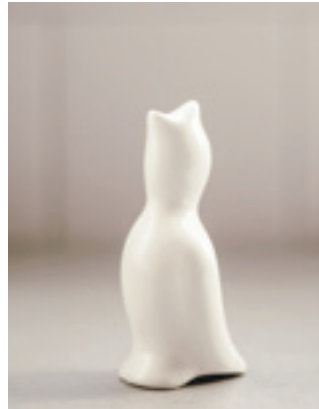
HONEY-03 ceramic pie bird