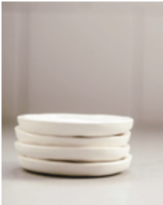
HONEY-02 ceramic butter pat dish