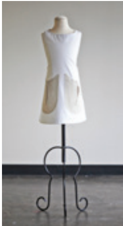
6A sugar cone scoops (child)