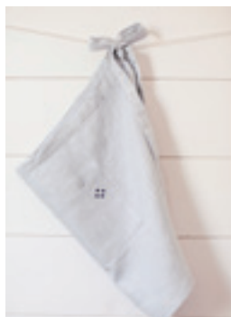
BLUE-07 chambray waist apron