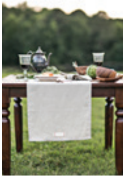
H-02 table runner (18"x70")