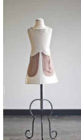
6C cozy cupped cocoa (child)