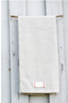
H-08 tea towels (set of 2)

heirloomed is a 100% linen tabletop collection packaged in kraft bags nostalgic of a rustic market bakery and tied with a single waxed thread cord. set upon a classic neutral palette, each heirloomed piece includes a signature tag detail with simple red stitching.