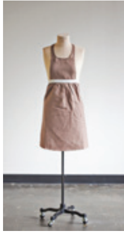
2A pecan orchard pleasantries