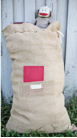
HC-01 burlap santa sack

our holiday collection is a delightful array of keepsake pieces, perfect for starting a family tradition of your own. each heirloomed piece includes a signature tag detail with simple red stitching.