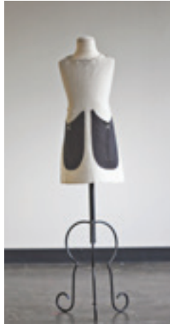
6B bowls of batter (child)