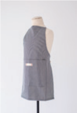
RAIL-02 railroad stripe toddler apron RAIL-03 railroad stripe children's apron