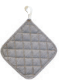
RAIL-12 railroad stripe pot holder (set of 2)