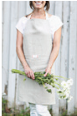
H-04 bistro apron