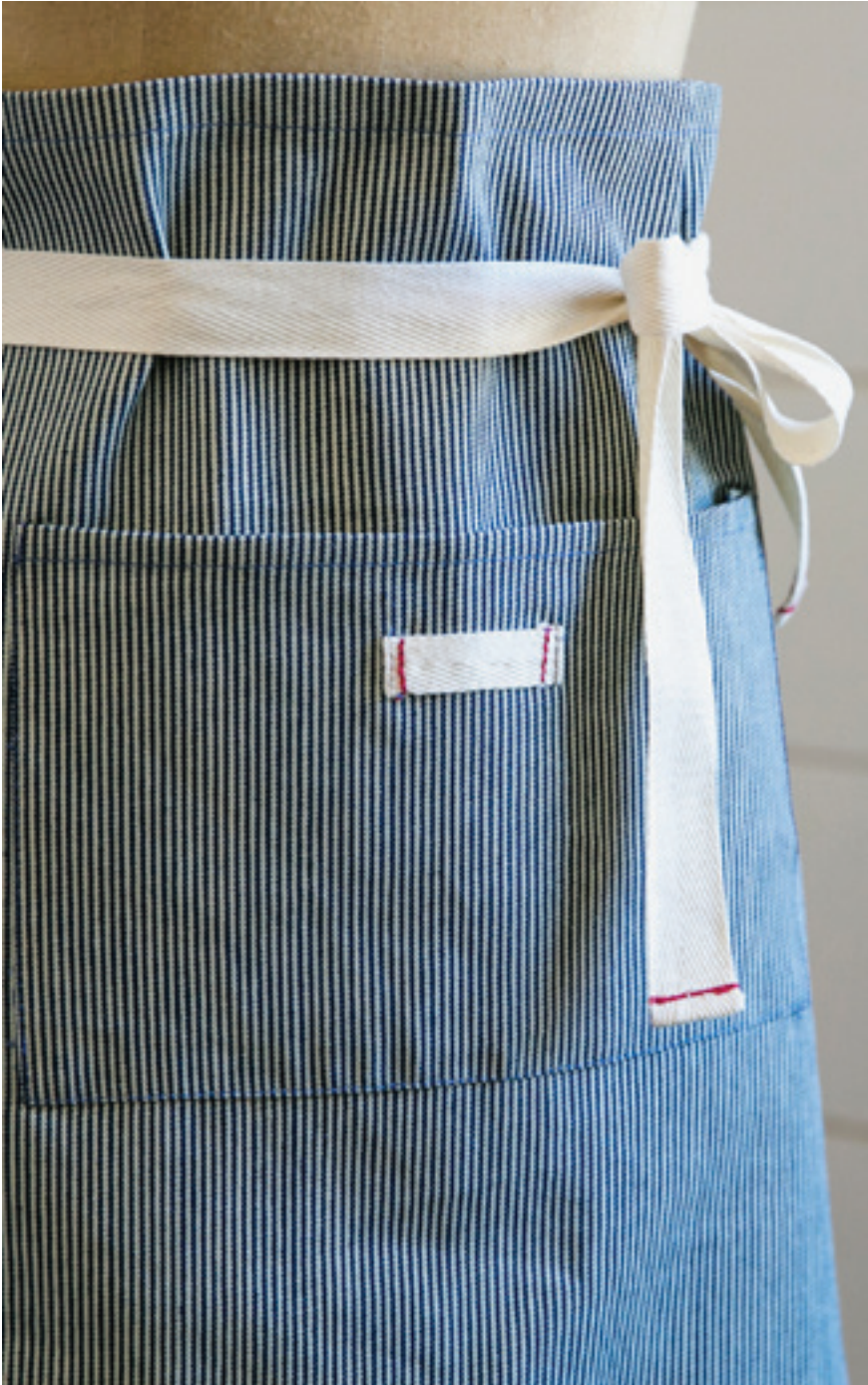
RAILROAD STRIPE COLLECTION