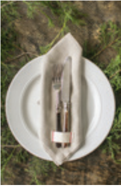
H-01 napkins (set of 4) (18" square)