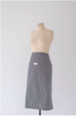
RAIL-01 railroad stripe cafe apron

A fresh and clean design aesthetic and a continuation of our commitment to heirloom-quality and meaningful goods. This heavy duty, 10 oz. Railroad Stripe fabric provides the perfect construction for our new workhorse aprons and tabletop collection.