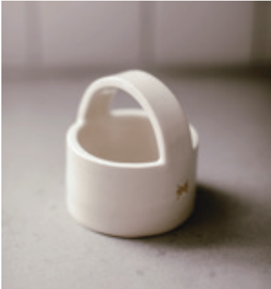
HONEY-01 ceramic biscuit cutter

In collaboration with small-batch ceramics artisan Honeycomb Studio, our Honeycomb x heirloomed pieces bring a modern twist to some traditional staples in the kitchen. Our signature collaboration makers mark adds a subtle design detail on each porcelain piece.