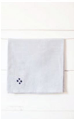
BLUE-01 chambray dinner napkins (set of 4)

This collection was inspired by the classic wardrobe staple colors of chambray + indigo, fresh for spring / summer but a classic year round that will never go out of style. The hand-painted dot pattern was inspired by detail on a vintage bandana, making for a subtle added touch of design for your collection and coordinates well with our other Oatmeal Linen + Railroad Stripes.