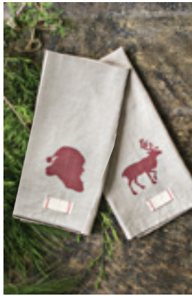
HC-09 tea towels - (set of 2) (printed - Santa or Reindeer)