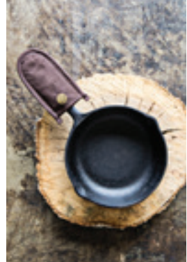
WC-04 cast iron skillet handle holder