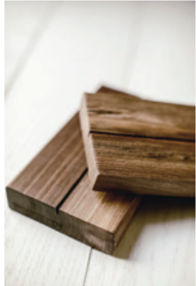
Wooden Recipe Card Holder