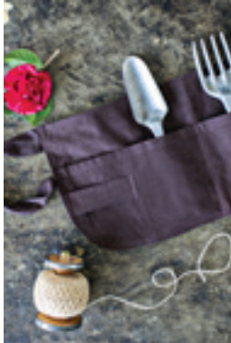
WC-02A farm-to-table garden apron