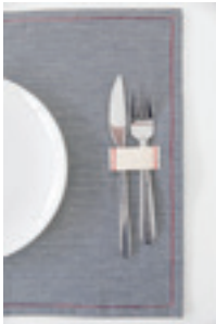
RAIL-06 railroad stripe placemat (set of 4)