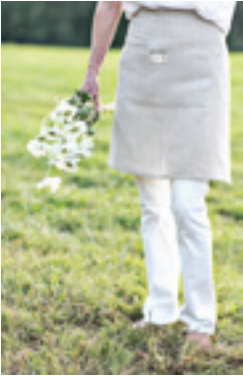
H-03 waist apron