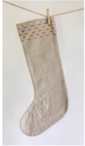
HOL-01 hand-stitched stocking (linen)