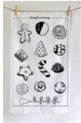
HOL-07 holiday tea towel (holiday cookie exchange)