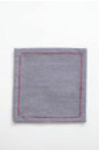
RAIL-04 railroad stripe cocktail napkins (set of 4)