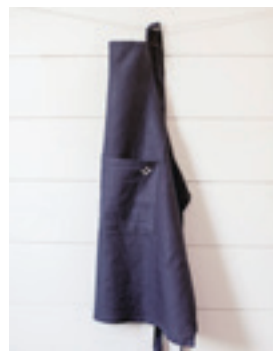
BLUE-08 indigo full bistro apron