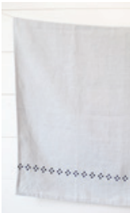
BLUE-04 table cloth (60" x 90")