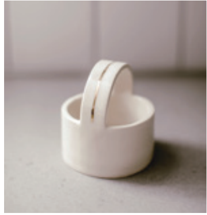
HONEY-04 ceramic biscuit cutter - Gold