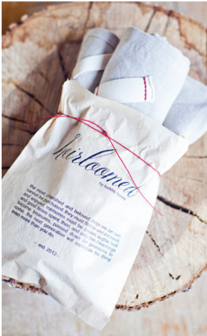
HEIRLOOMED LINEN COLLECTION