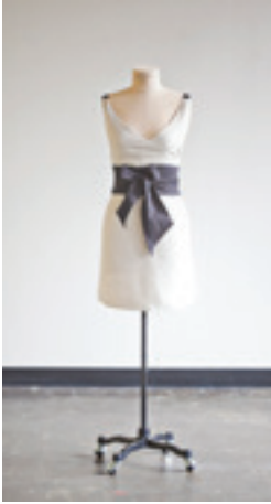
3A rollings of cinnamon