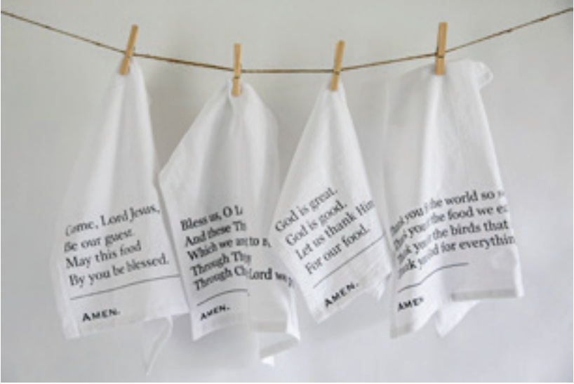
BLESS-01 napkins (set of 4)

Our Simple Blessings Collection was inspired by the simple prayers our family says before mealtime to give thanks. An effortless 100% crinkle cotton makes these liners great for everyday use and perfect for children to learn the most basic blessings around the table.