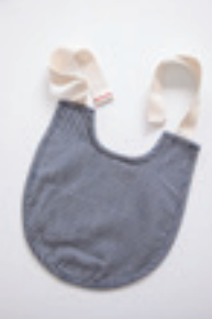
RAIL-09 railroad stripe baby bib