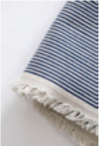
RAIL-08 railroad stripe selvedge edge tea towel