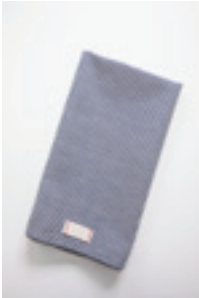
RAIL-07 railroad stripe tea towel