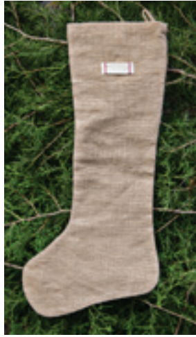
HC-03 burlap holiday stocking