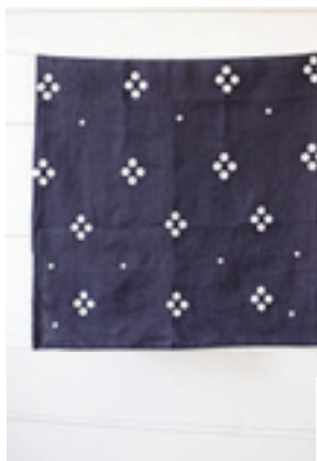
BLUE-03 linen throw (60" square)