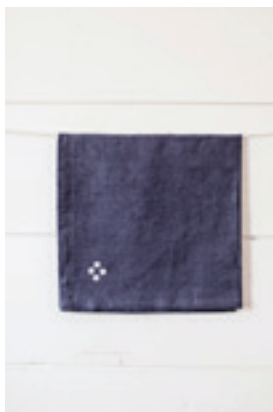
BLUE-02 indigo dinner napkins (set of 4)