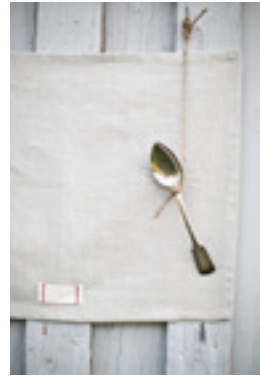
H-06 placemats (set of 4)