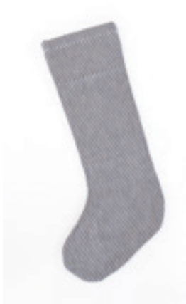
HOL-02 railroad stripe stocking (set of 2)