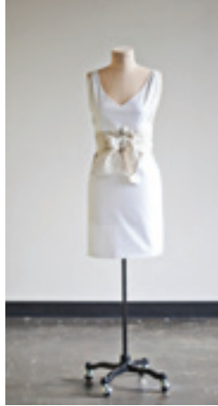
3B frosty tin marshmallows