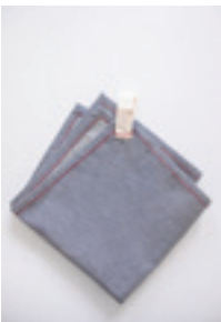
RAIL-11 railroad stripe dinner napkins (set of 4)