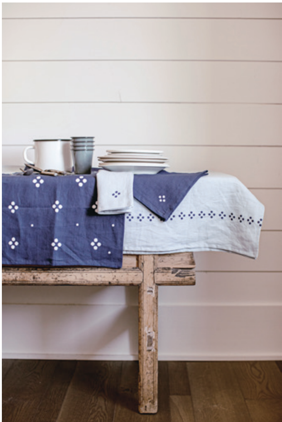
INDIGO + CHAMBRAY DOT COLLECTION