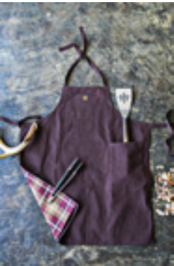
WC-01 men's grilling apron

Inspired by the style of the South, our durable & classic Waxed Canvas Collection features pieces that celebrate true crafts passed down for generations. A rich chocolate brown waxed canvas is balanced by plaid flannel interior fabric and brass button detail on each piece in the collection.