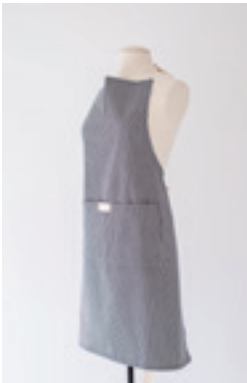
RAIL-10 railroad stripe full bistro apron