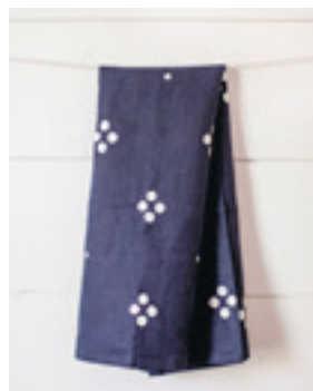
BLUE-06 indigo tea towels (set of 2)