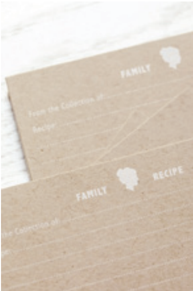
Family Recipe Card Bundle