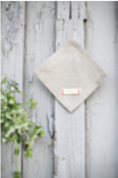
H-07 cocktail napkins (set of 6)