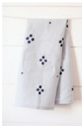
BLUE-05 chambray tea towels (set of 2)