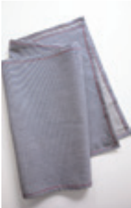
RAIL-05 railroad stripe table runner (18"x70")