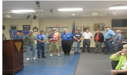
Ten Navy Veteran's receiving their Vietnam War 50 th Anniversary Lapel Pin at the Vietnam War 50 th Anniversary.