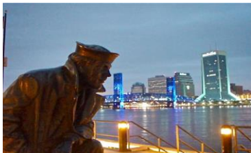
A picture of the "Lone Sailor" on the Waterfront in Jacksonville, FL. during the National Convention.