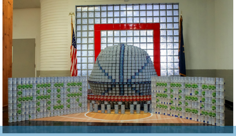
The Indiana State Fair Commission won the award for "Best Structure" with this entry in the 2020 Canstruction Competition. The agency also collected the most cans.

Last year alone, we saw a recreation of the field and end zones of Lucas Oil Stadium, American flags, state agency logos and program promos, a tribute to Super Mario Bros., and at least two "baby Yoda" (do we have to call him 'Grogu'?) assemblies. The winner for "Best Structure" (one of two contest awards) was