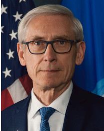
TONY EVERS, GOVERNOR, STATE OF WISCONSIN