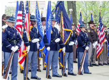
HONOR GUARD, WISCONSIN STATE PATROL