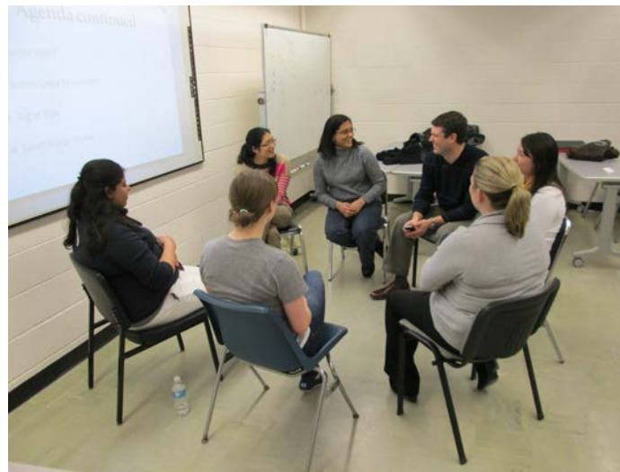
Students participate in a workshop to learn how to best translate research to community audiences.