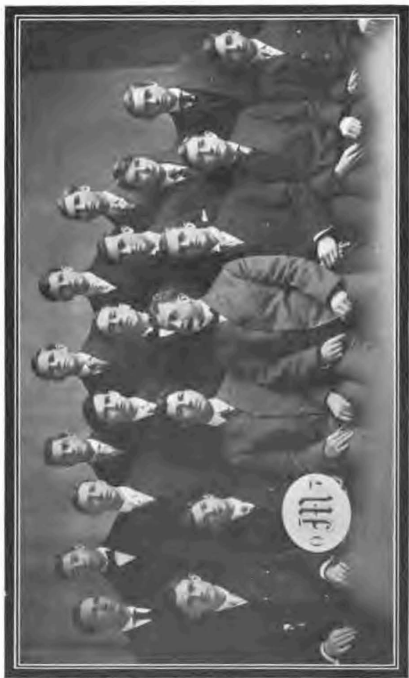
JANUARY CLASS OF 1907.