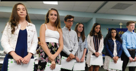
Participants in our annual Essay contest—"Why a Catholic Education is important to me".