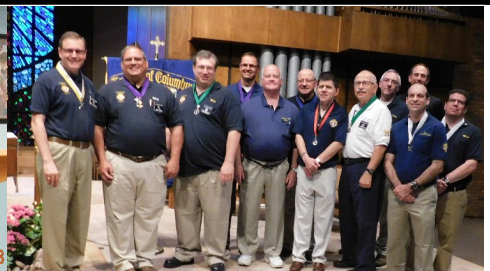
Newly Invested officers of Council 3880 which was held Tuesday, June 19, 2018. Congratulations to all of you!