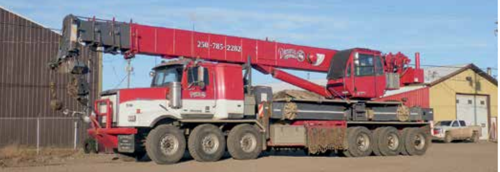
2013 Western Star 4900SA w/Terex 60 Ton