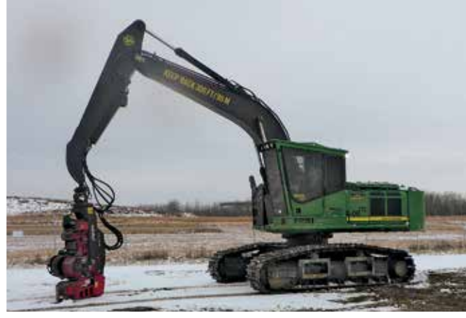
2011 John Deere 2454G w/Waratah 623C