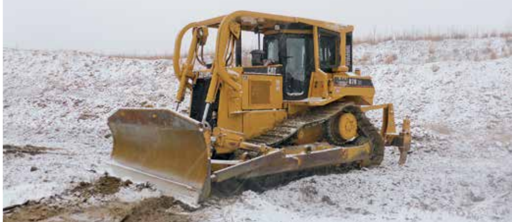
Caterpillar D7R XR Series II