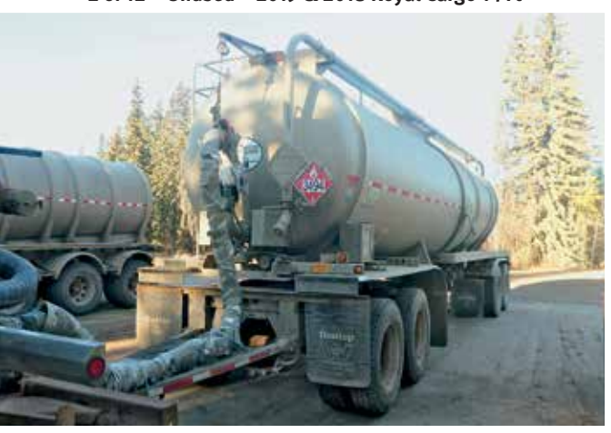
1 of 3 - Stephens 31800 Litre