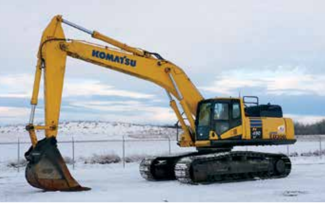
2 - Caterpillar 561M Caterpillar D8R 2011 Komatsu PC490LC-10