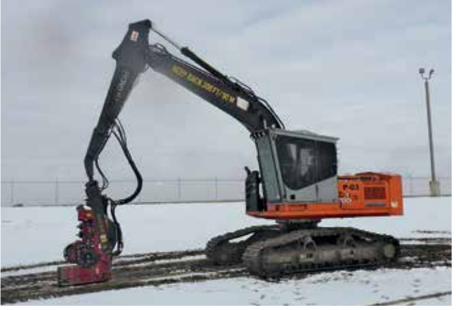
Hitachi ZX200LL w/Waratah HTH622