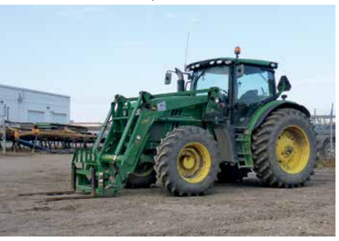
2013 John Deere 6450R