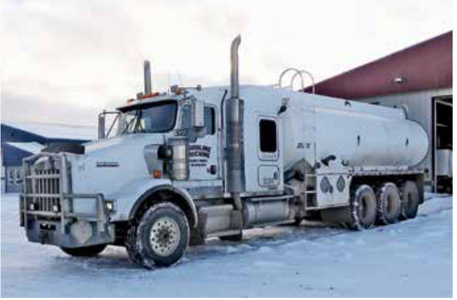
2015 Western Star 4900SA & 2016 Midland