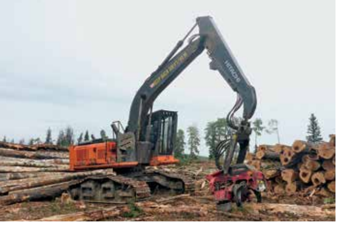
2015 Hitachi ZX210F-3 w/Waratah 622C