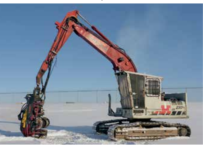
Link-Belt 210LX w/Waratah HTH620