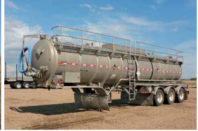
2015 Heil 38000 Litre