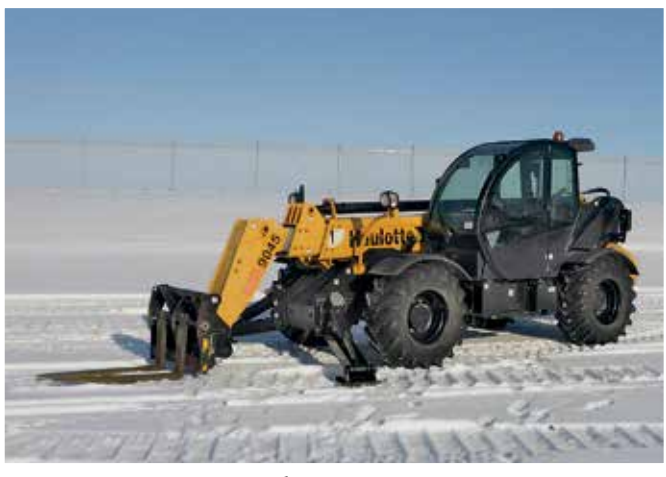
2013 Haulotte HT9045 4x4x4