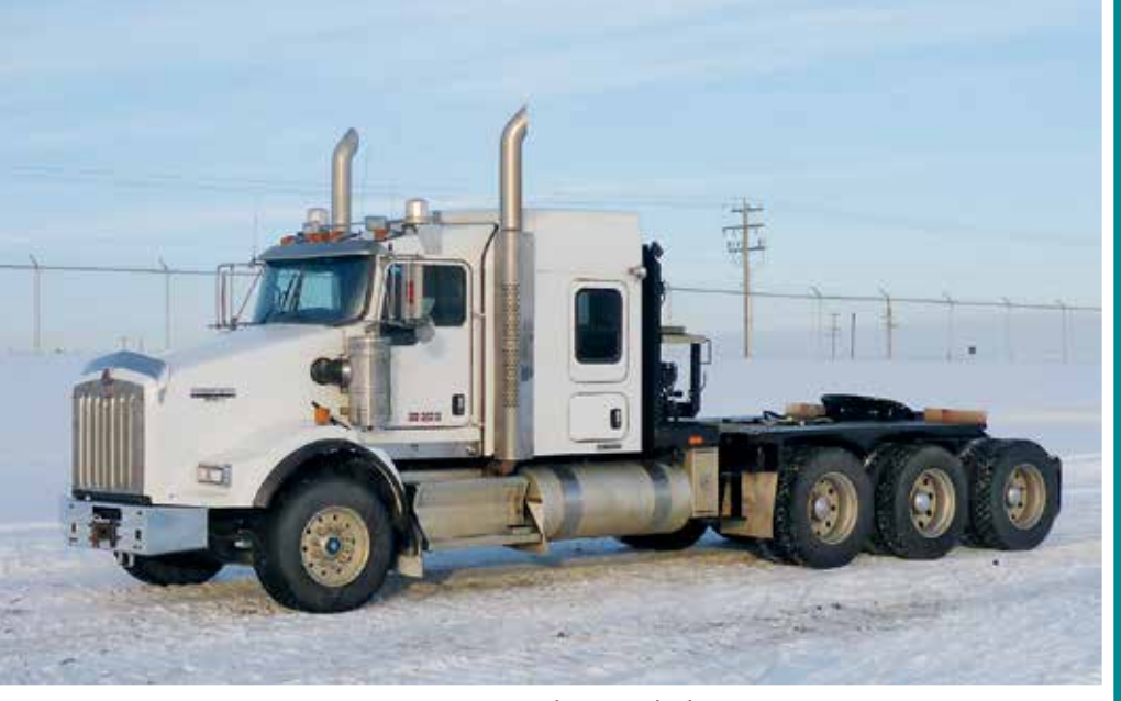
2015 Kenworth T800 Winch