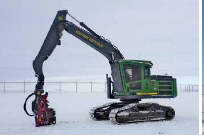
2017 John Deere 2154G w/Waratah HTH622B