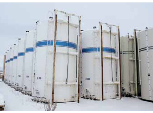
Large Qty of 400 BBL