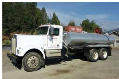
Kenworth T800 3000 Gallon