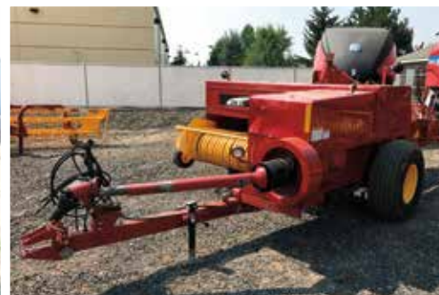
2008 New Holland 580