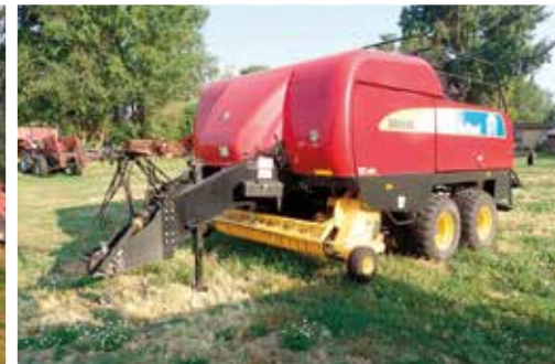
1 of 3 – 2010 New Holland BB9080 3x4