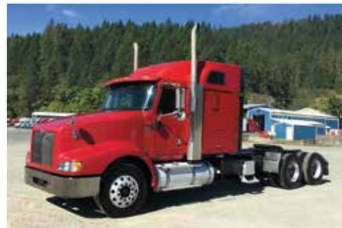
1 of 2 – International 9400I