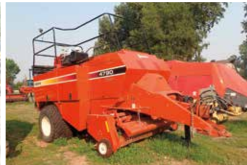
Hesston 4790 3x4