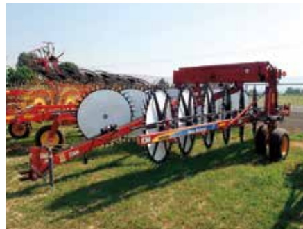
Unused - 2014 New Holland H5980