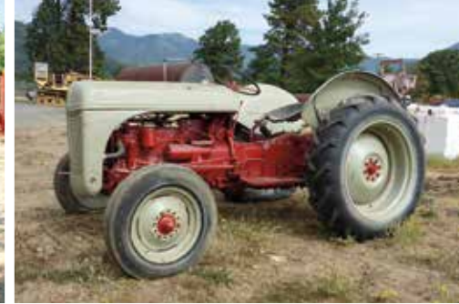
1948 Ford 8N