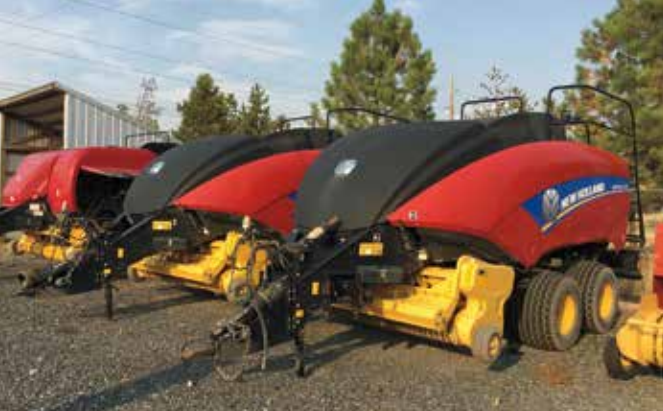
2 of 4 – Late Model New Holland 340 3x4