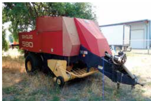
New Holland 590 3x4