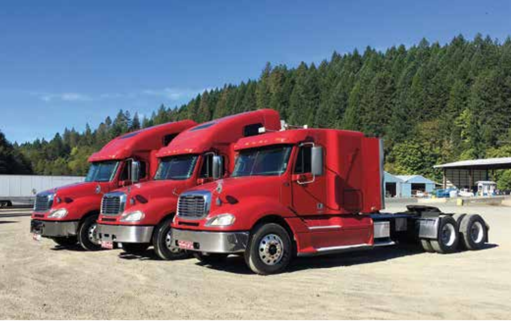
2012, 1 of 3 – 2011 & 2010 Freightliner Columbia