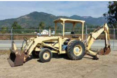
Ford 8000 w/753