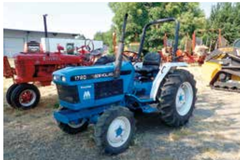
New Holland 1720