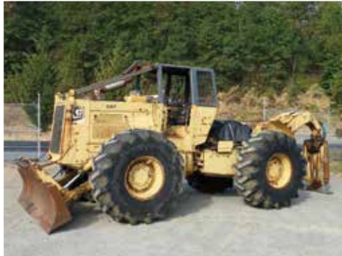
1 of 2 – Caterpillar 518 w/Esco