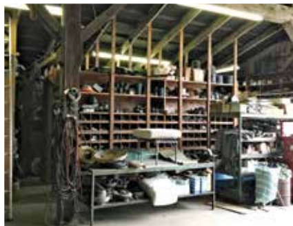
Qty of Shop Tools