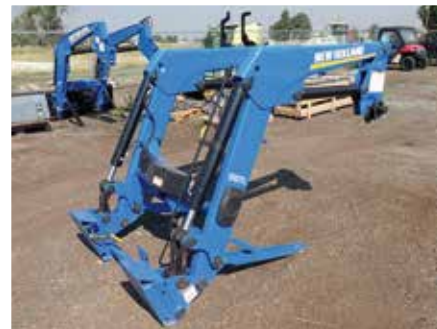
Unused - 2015 New Holland 815TL