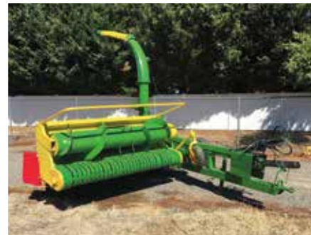
1 of 3 - John Deere 3970