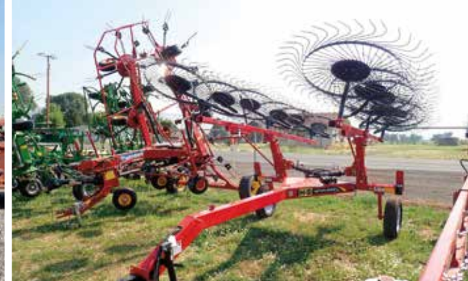
1 of 3 – Unused – Late Model H&S AR1261