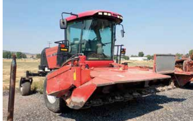
2009 Case IH WD1903