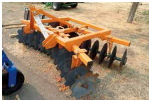
Unused – 2013 Woods DHM7 7 Ft