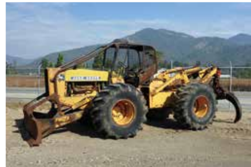
John Deere 540AB