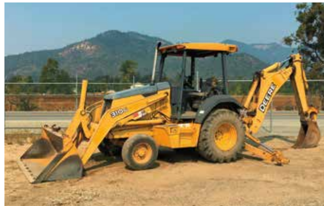
John Deere 310G