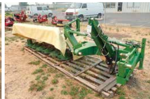
Unused – 2015 Krone Easy Cut 280