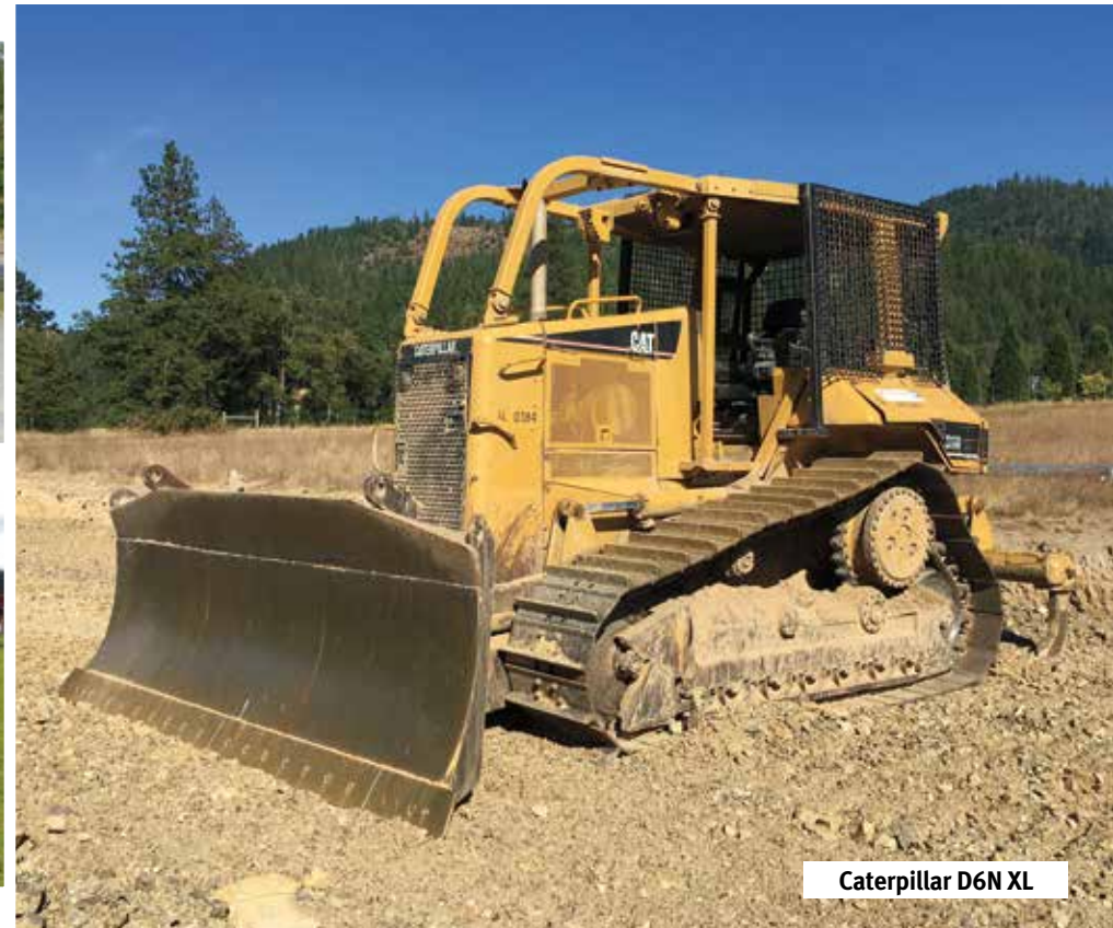
Caterpillar D6N XL