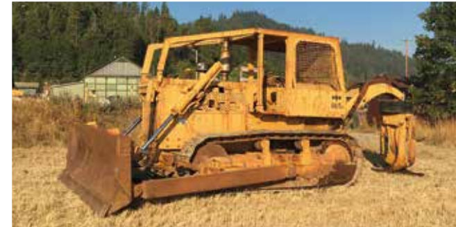
1 of 2 – Komatsu D65E-6 w/Esco