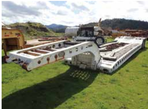
Cozad 35 Ton