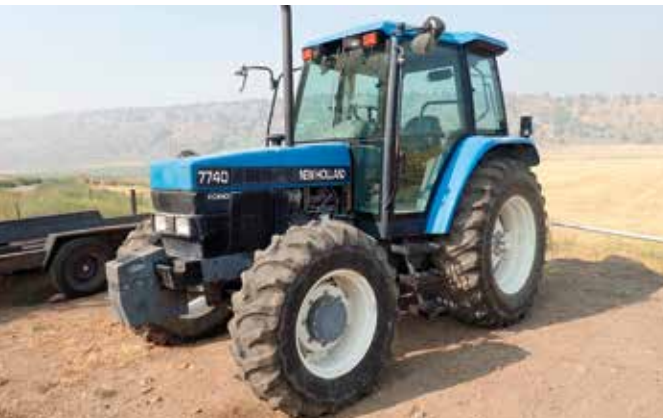
1 of 2 – New Holland 7740