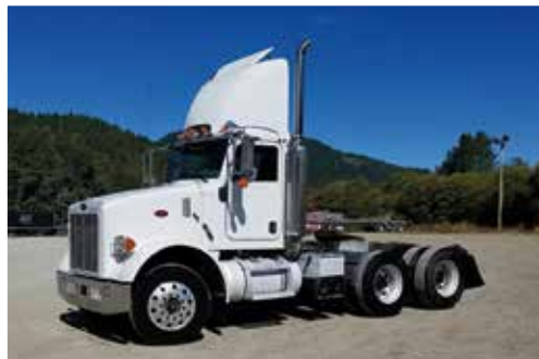
1 of 2 – Peterbilt 357