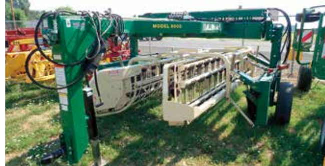
2014 Allen 8803