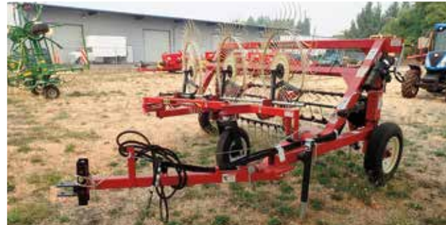
Unused - 2015 H&S HM7A