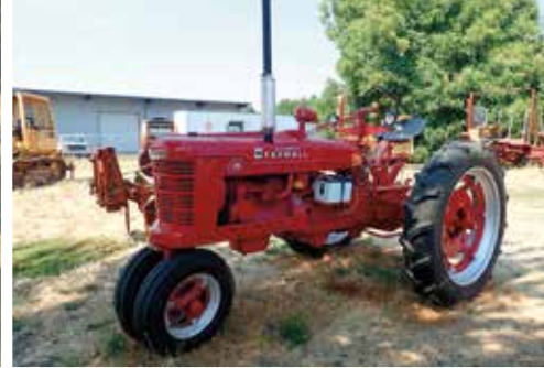
1948 Farmall H