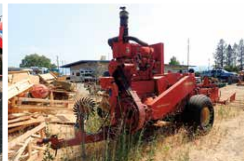
New Holland 505