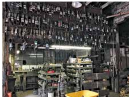
Qty of Shop Tools