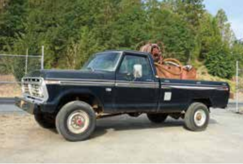
1 of 3 – Ford F250 4x4