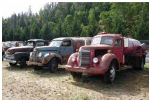
Qty of Antique Trucks