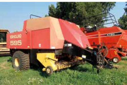
1 of 2 – New Holland 595 3x4