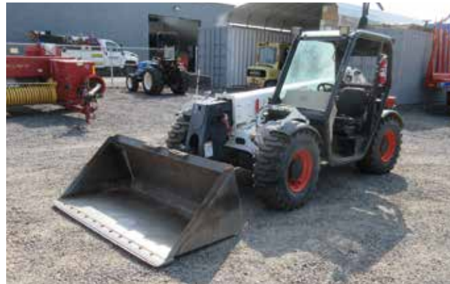
2009 Bobcat V417 4000 Lb 4x4x4