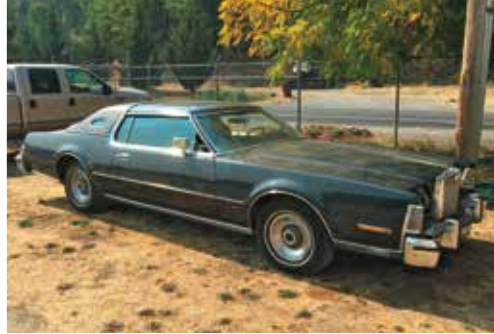
1976 Lincoln Continental Mark IV