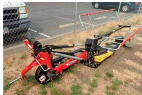
Unused – 2015 Fella-Werke SM168