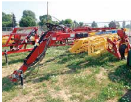
Unused - New Holland 216