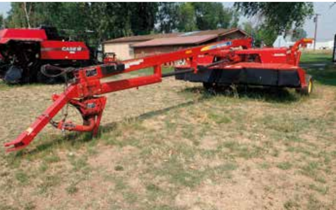
2013 New Holland H7450 13 Ft