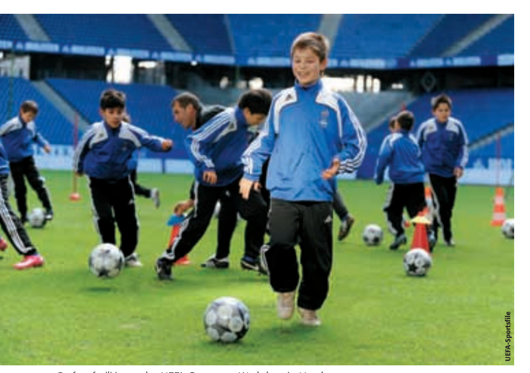
Perfect facilities at the UEFA Grassroots Workshop in Hamburg

This has been an ongoing process during 2009 and the year ended with recommendations to award Iceland a fourth star (the social and disability star). The same star allowed Georgia to move from one to two-star status, while the Republic of Ireland combined the same star with the women's/girls' participation star to attain three-star status, while both Liechtenstein and Sweden received endorsement in the registered participants, women's/girls' and promotion and growth categories to attain four-star status. The fact that the