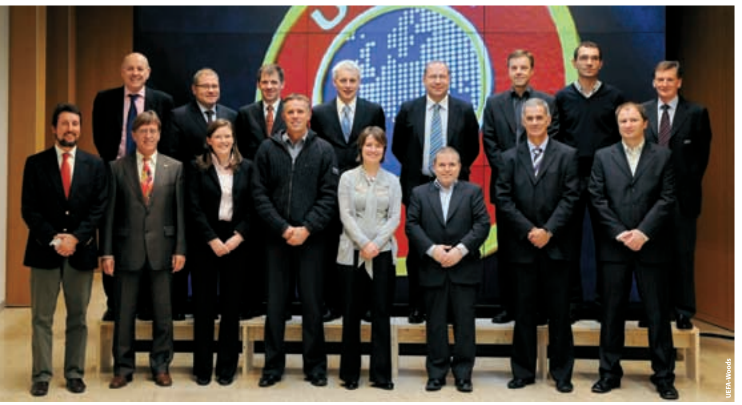
The Grassroots Panel met in November in Nyon.

47 members currently share 117 stars is a clear demonstration that the UEFA Grassroots Charter is a powerful instrument in terms of stimulating national associations to implant and enhance their grassroots structures.