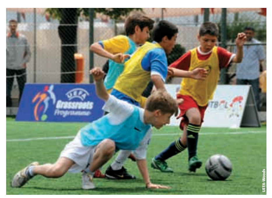
Grassroots matches are typically linked to the major UEFA club competition finals as was the case at the UEFA Cup final in Istanbul.

On 28 February, almost three months before the UEFA Cup final, the ball started rolling at a large-scale youth tournament staged over 12 weekends and culminating in finals played on the eve of the UEFA Cup showdown. The tournament involved 144 teams split into three age categories between 9 and 14. Each team comprised ten players, at least two of whom had to be girls.