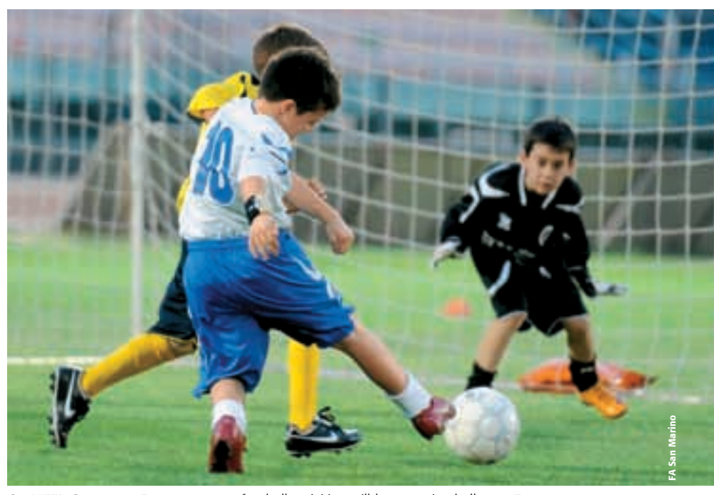
On UEFA Grassroots Day, grassroots football activities will be organised all over Europe.

Just as football begins in its grassroots, so the build-up to the first Saturday night UEFA Champions League final will commence with grassroots action. Following the UEFA Grassroots Day on the Wednesday, the UEFA Women's Champions League final will take place on the Thursday evening. Two days later, Europe's showpiece for professional clubs will provide the icing on the cake, and it will be appropriate to remind ourselves during that week that grassroots football is the cake. Recognising and celebrating grassroots football on UEFA's Grassroots Day is therefore something worth doing – an initiative which will be fully endorsed by those who carry the ball close to their heart.