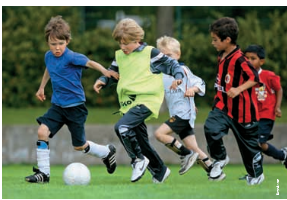
Grassroots football is an excellent means of integration.

We had a viewing audience on TV for the FIFA Under-17 final in Nigeria of 1.3 million, and overall it was stated that 40% of the population tuned in at some point. Many of the viewers were children and our Under-17s have become idols for them. As I said earlier, our clubs are at their intake limit, but the exploits of our youth squad will encourage many to increase their commitment and to improve their skill level. When we won the European title in 2002, it had an effect and now this World Cup success will stimulate others to emulate our young champions. The technical department of an association must focus on both the grassroots and the elite youth football - they are linked and equally important. If you are a technical director, you must love grassroots football and the elite youth game with the same passion.