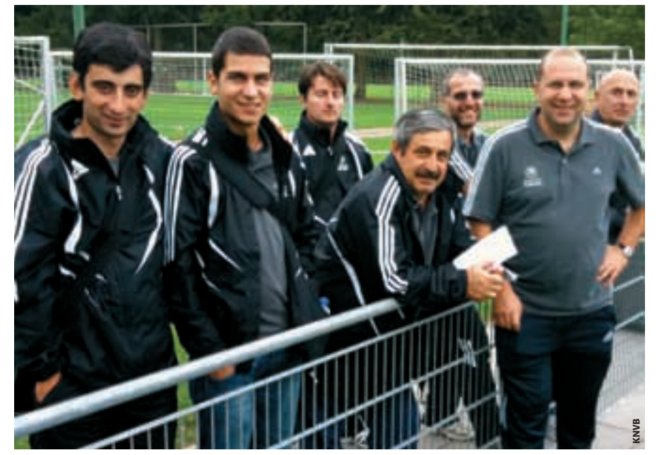
Delegations from Belarus, Bosnia-Herzegovina and Georgia visit the Netherlands.

The first stop was Leusden, where a local amateur club, Roda '46, presented its youth development scheme and staged a practical session with its youth players. Back at Zeist, the opening day finished with an after-dinner session on Dutch development structures by Corné Groenendijk. The second day featured a visit to another club, AWC Wijchen, where the menu blended a practical training session with