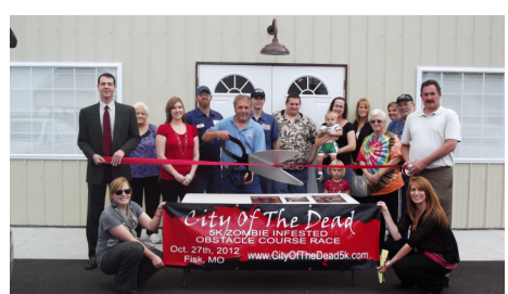
Cannibalistic Tendencies City Of The Dead 5K October 23rd