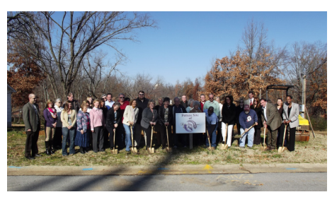
Recycling Grace Women's Center Groundbreaking November 28th