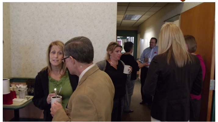
Ryan's of Poplar Bluff October 5th