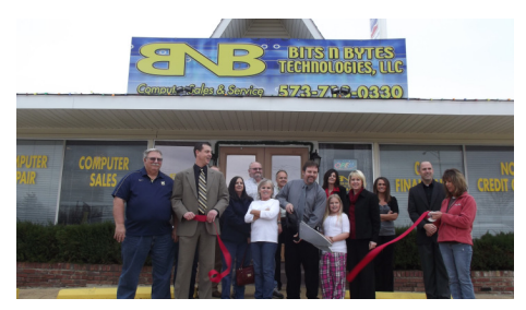
Bits N Bytes Technologies New Location December 6th