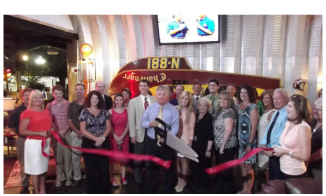
Money Mizer 15th Anniversary November 8th