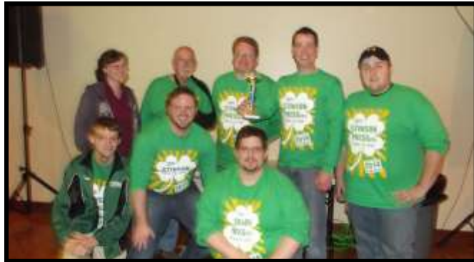
3rd Place Stinson Press