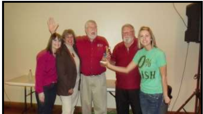
2nd Place Lion's Club