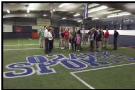
Ozark Sports Plex Jan 3rd