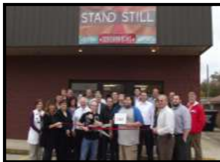
Stand Still Nov 5th