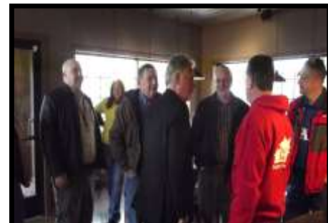
Hi-Tech Fire Protection Feb 7th

The next First Friday Coffee will be Friday, June 6th at Butler County Title Company 2911 N. Westwood Blvd.