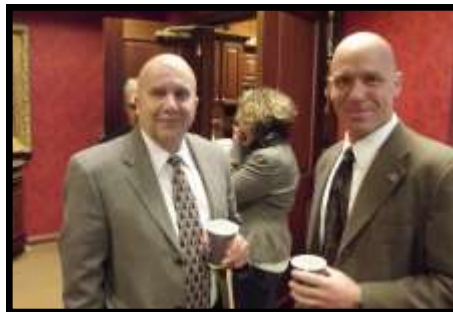
First Community Bank Dec 6