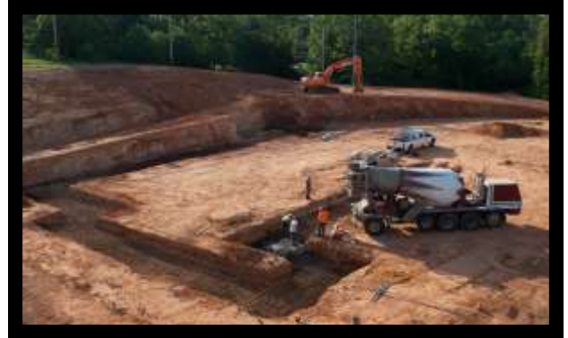
Ground Breaking & Dirt Work for the Humanities and Social Sciences Building