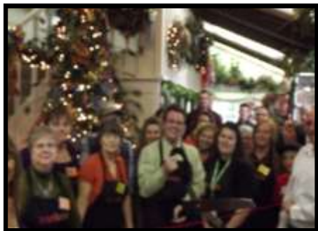
New Leaf Flowers Nov 1st