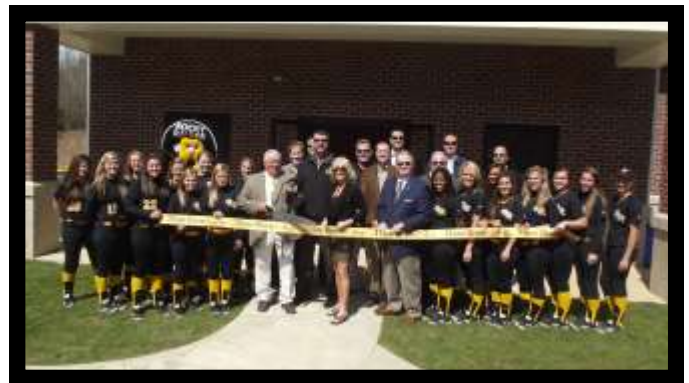
Ground Breaking & Ribbon Cutting for the New Softball Club House