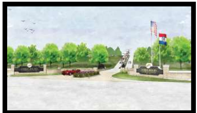
Ground Breaking for the Future New Entrance of Three Rivers College

Fastest growing Community College of 2014!!