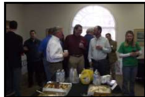
Smith & Company March 14th