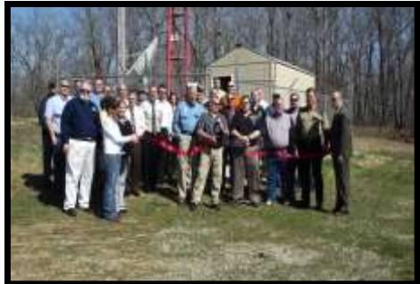
Butler County EMA April 10th