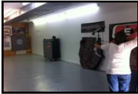
Redneck Racks & Reels Nov 1st