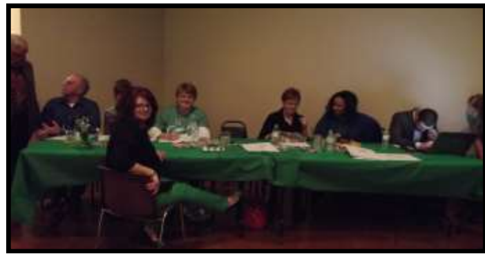
Thank you to our AWESOME Judges!