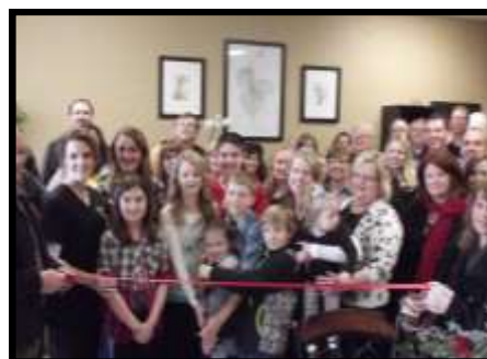
Serenity Spa Feb 7th