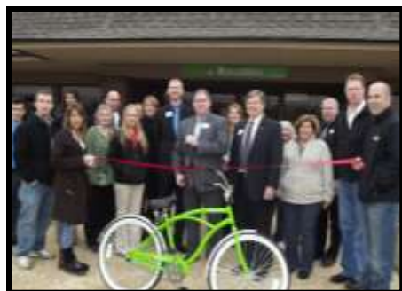
Regions Bank Jan 31st