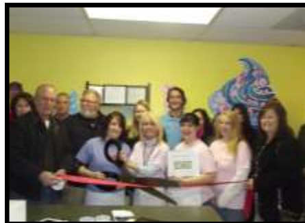
Sweet Revenge Jan 21st