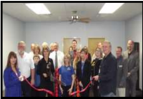
Fit Room March 11th