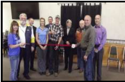
JAC Roofing April 15th