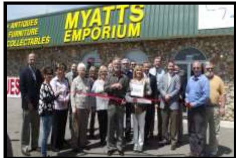
Myatts Emporium April 17th