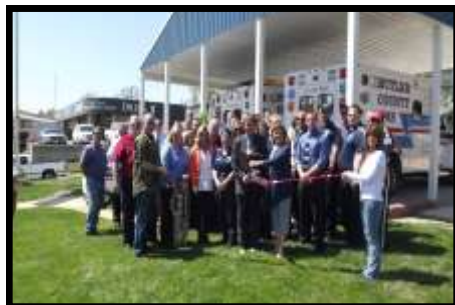
Butler County EMS April 22nd