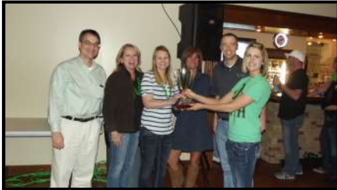
1st Place Southern Bank