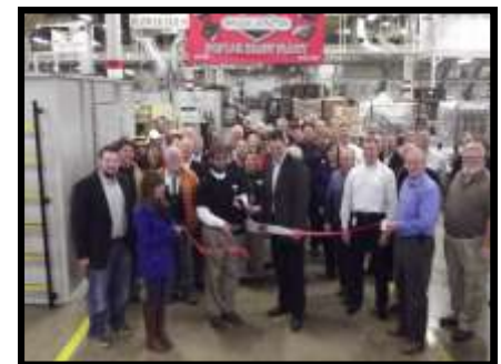
Briggs & Stratton Feb 17th