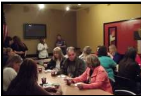
Dullenty Chiropractic April 4th