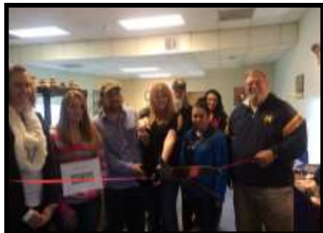
Rainbow Rocks Dec 5th