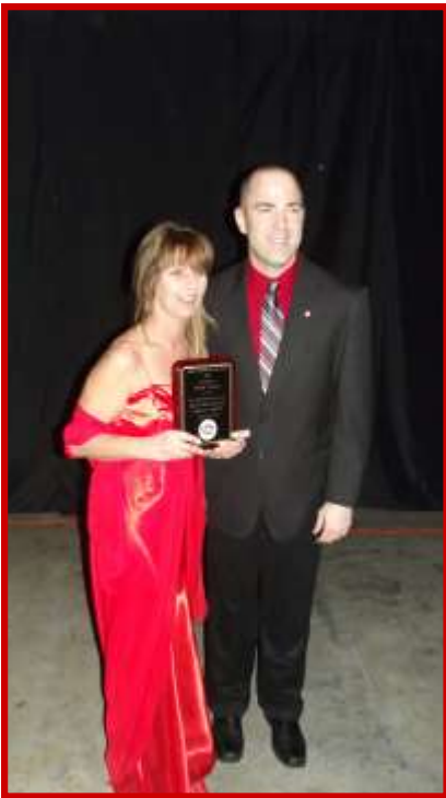
Bottom: Gateway to Leadership graduates receive award for completion of program.