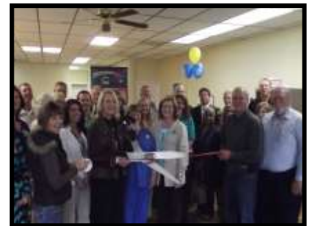
VNA Nov 6th