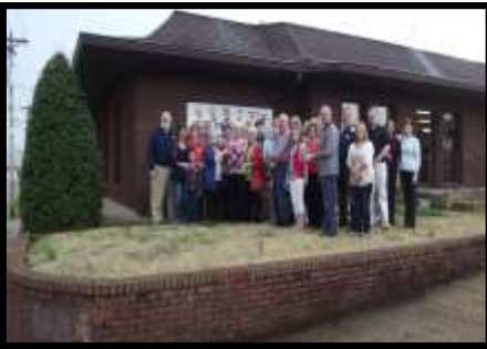
Child Concern Center April 11th