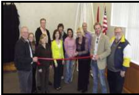
Essential Trained Care March 26th