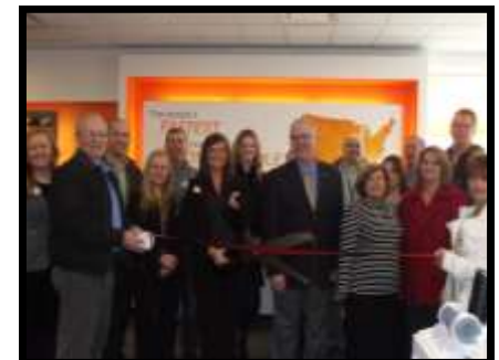
AT&T Jan 30th