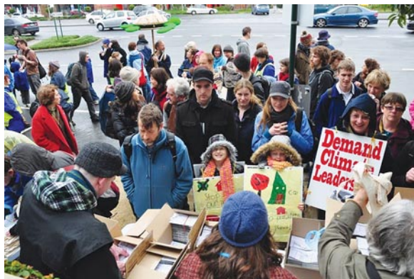
Walkers in Deakin gather to collect their leaflets and maps for letterboxing.