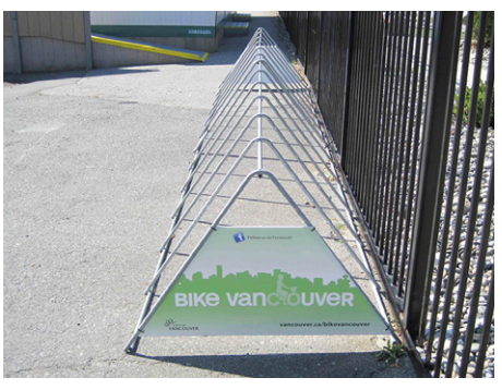
City of Vancouver bike racks.

The equipment pictured above (available in limited quantities) can be rented from the City of Vancouver. Strong volunteer presence is required.