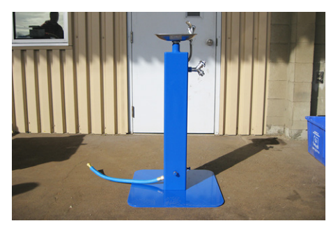
City of Vancouver water fountains.