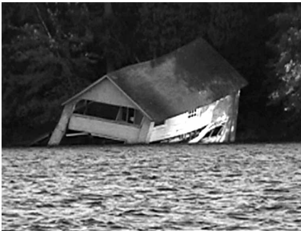
House (everythinghappensatonce) (1999), single-channel video projection, 20 minutes.