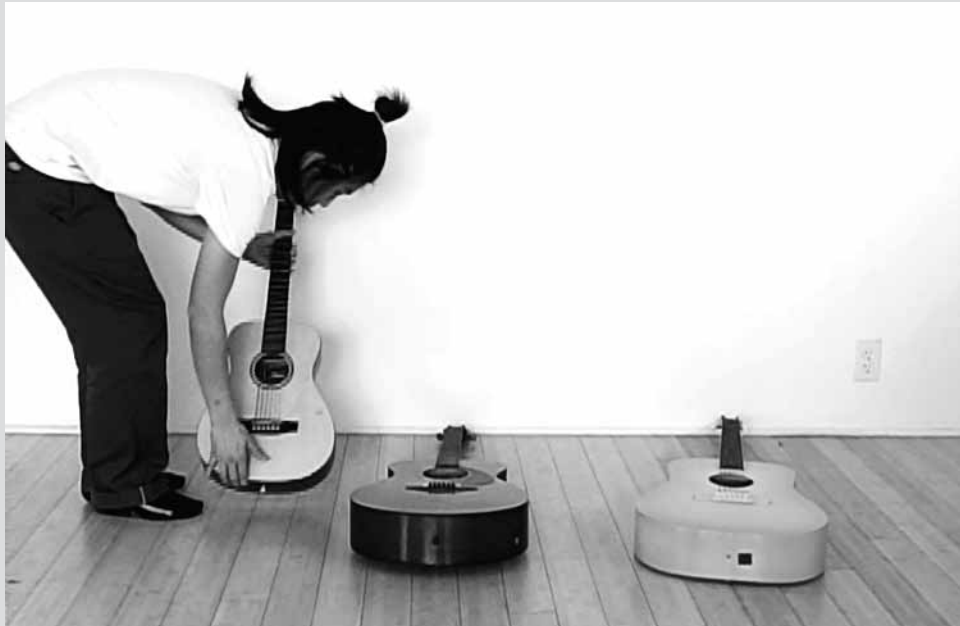
GAD (2004), single-channel video projection. 15 minutes

are the results of distortion and manipulation that show the problems of interpretation of language...or maybe even interpretation as a form of meddling.