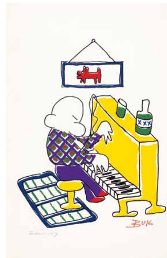
Illustration by Charles Bukowski.

This catalogue was printed in an addition of 500 copies and is available through Pitzer College