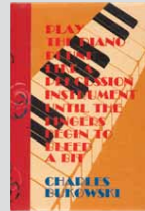
Book cover design by Barbara Martin. Play the Piano Drunk Like a Percussion Instrument Until the Fingers Begin to Bleed a Bit. Black Sparrow Press (1979).

Ciara Ennis: Presented in two very different forms, the exhibition presents a curious pairing of text and moving image works: an edition of five silkscreen text works, and a stop-motion video of an antique parlor piano obscured by a lifetime of discarded books. What led you to make such a pairing and what is the connection between the two subjects in these disparate works?