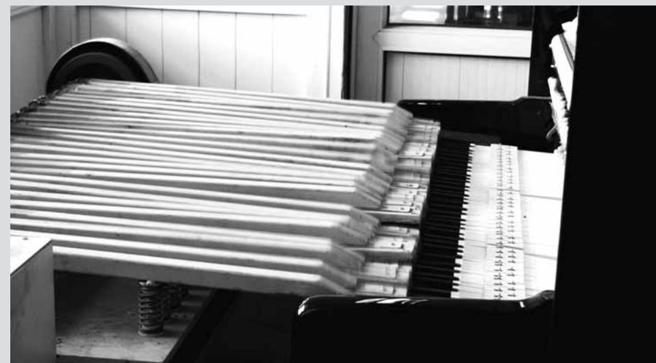
9,000 PIECES (2010), single-channel HD video installation. 5 minutes.

CE: The piano-playing machine in the Shanghai factory seems to have had a profound effect on you—it's hard to imagine something like that even existing and even harder to visualize it playing constantly for the equivalent of several decades. The continuous noise and use of the factory pianos stand in complete contrast to the silence and