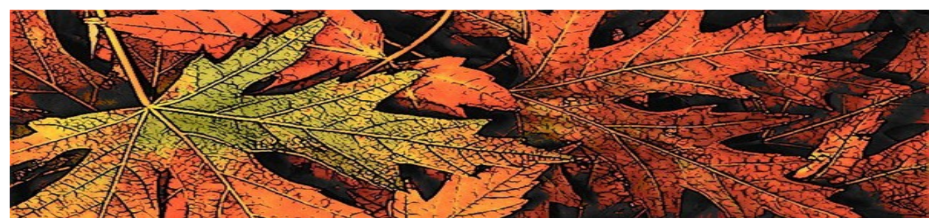
Greenleaf Bulletin - November 2010 Issue