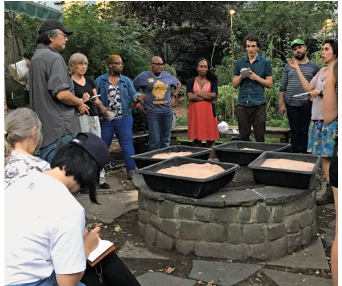
Participants learning about bokashi composting at a 2017 GreenThumb workshop

Bus: B48 to Franklin Ave./Gates Ave., B52 to Gates Ave./Classon Ave.