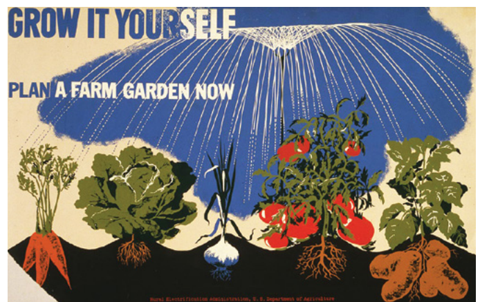
"Grow it Yourself" (Artist: Herbert Bayer, Rural Electrification Administration, U.S. Department of Agriculture, 1942.)

Bus: Bx21/Bx36/Bx40/Bx42 to Boston Rd./E. Tremont Ave.