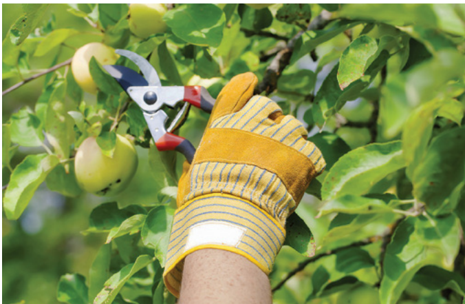
Pruning an apple tree

Bus: M9/M21 to E. Houston St./Ave. C, M14A to Ave. A/ E. Houston St.