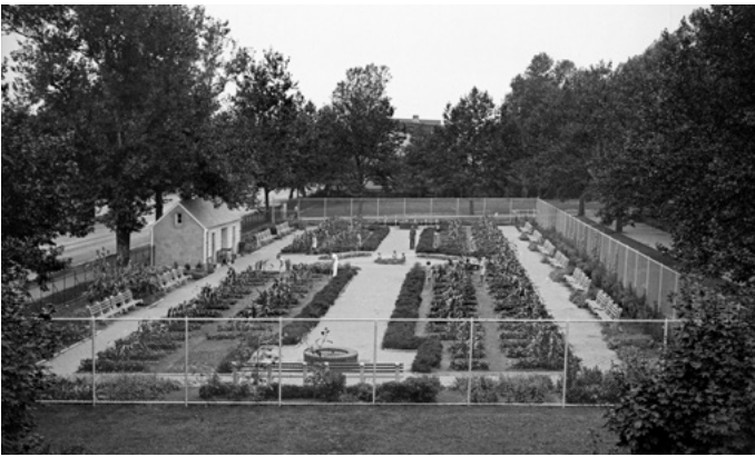
Highland Park Children's Farm | - August 1936 Brooklyn

NYC Parks The Arsenal Attn: GreenThumb 830 Fifth Ave. New York, NY 10065