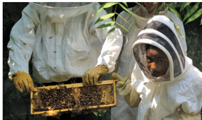
Young beekeepers in training

Bus: B62 to Driggs Ave./Grand St., Q59 to Grand St./Roebing St.