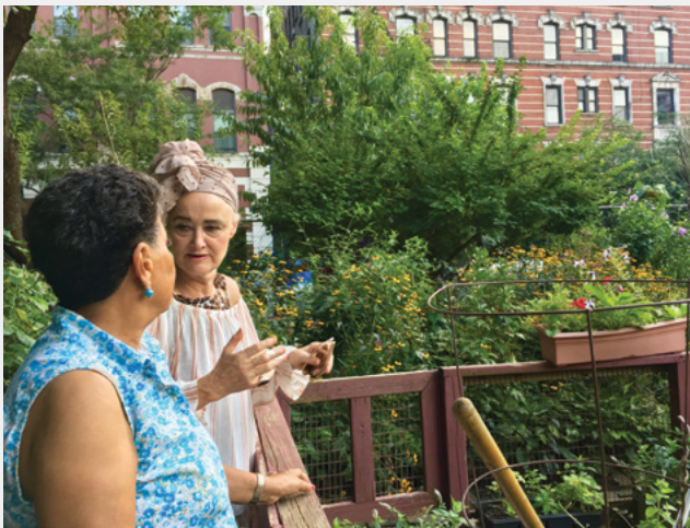
Gardeners at 9th Street Community Garden