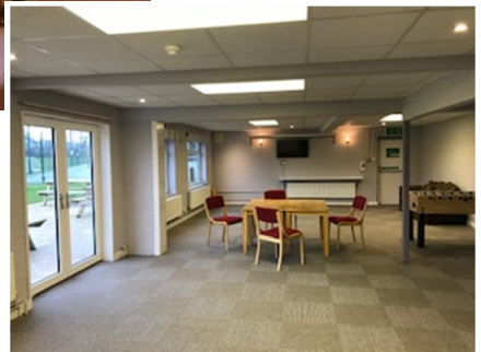
Club Room showing new patio doors