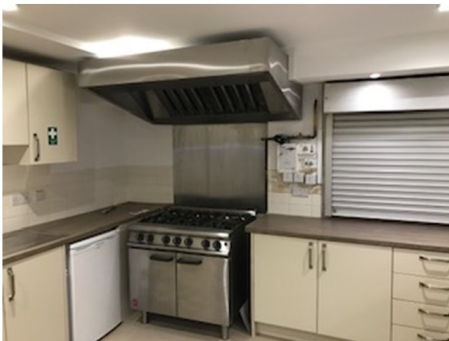
New Extraction System in Kitchen