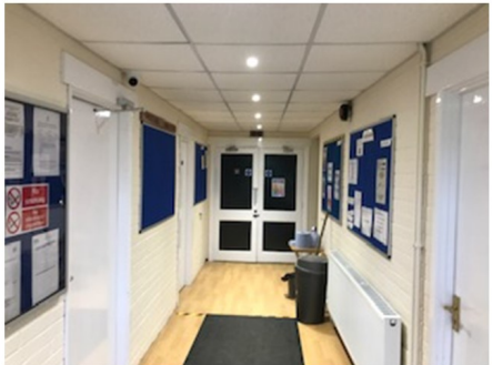
Foyer with new ceiling hiding all the old pipework