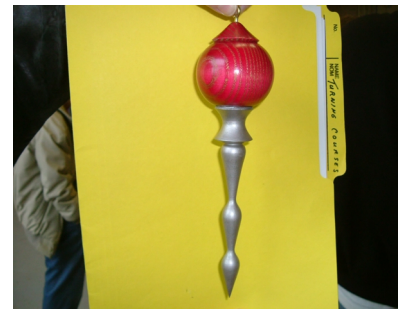
Completed Christmas Decoration