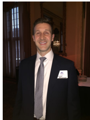
He fairly and zealously represented his clients. Corey Kraushaar Brown & James, PC