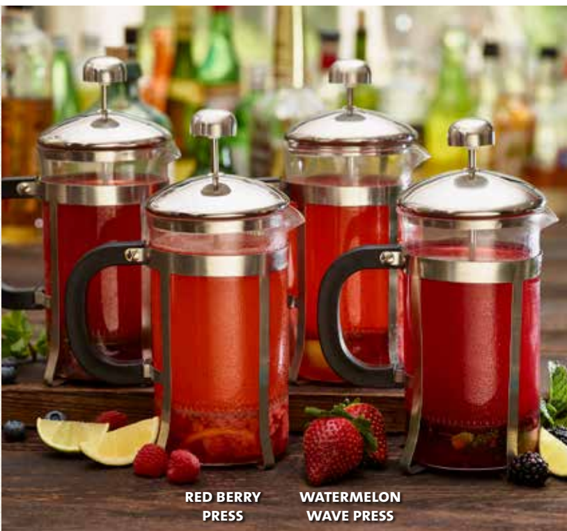
RED BERRY PRESS