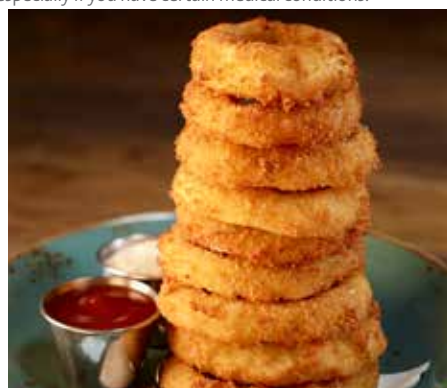
ONION RING TOWER