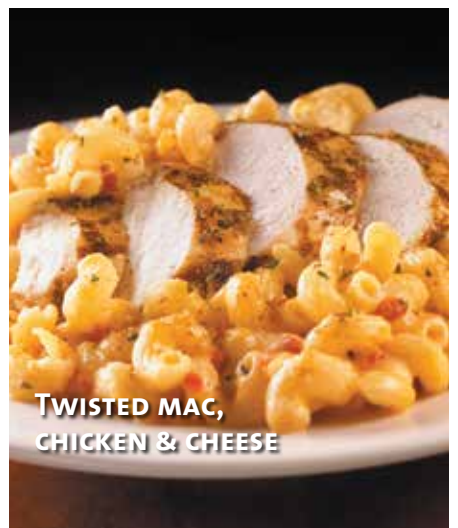
TWISTED MAC, CHICKEN & CHEESE