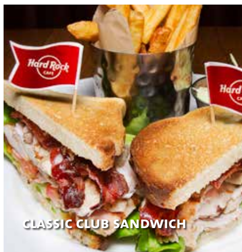
CLASSIC CLUB SANDWICH