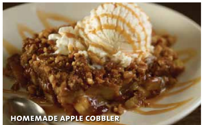
HOMEMADE APPLE COBBLER