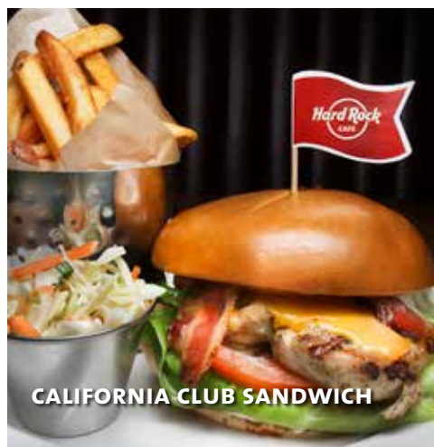
CALIFORNIA CLUB SANDWICH