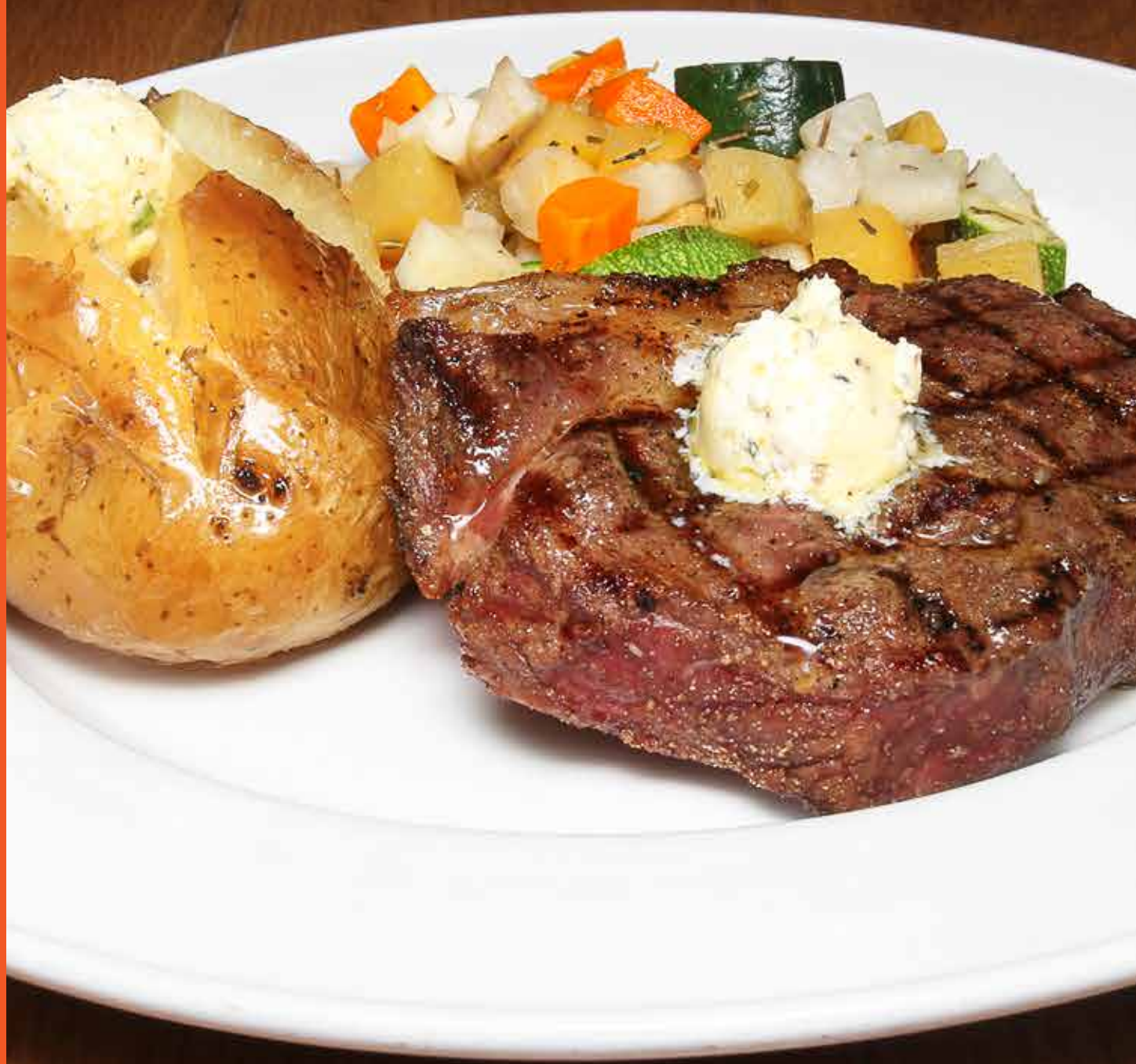
NEW YORK STRIP STEAK