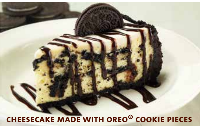
CHEESECAKE MADE WITH OREO® COOKIE PIECES

Vanilla ice cream and hot fudge on a dense chocolate brownie, topped with chopped walnuts, chocolate sprinkles, fresh whipped cream and a cherry.† 1890 KR.