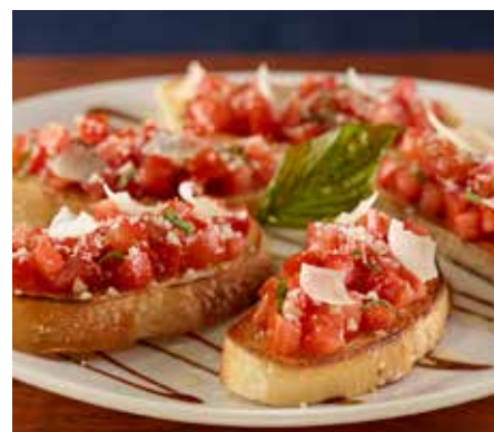
BALSAMIC TOMATO BRUSCHETTA