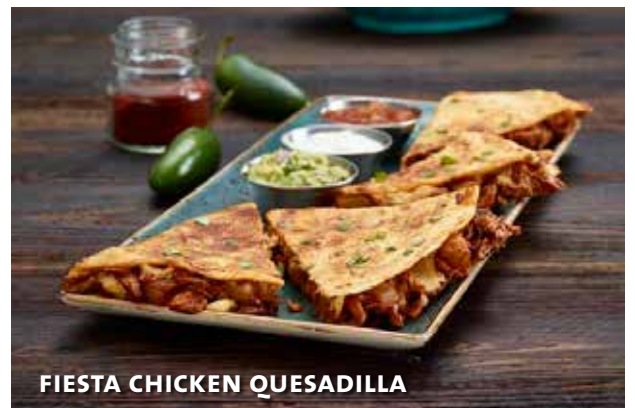
FIESTA CHICKEN QUESADILLA

Shredded tender pork in chipotle Tennessee barbecue sauce, onions, peppers, mozzarella and cheddar cheese blend and pico de gallo. 2490 KR.