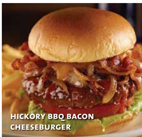
HICKORY BBQ BACON CHEESEBURGER