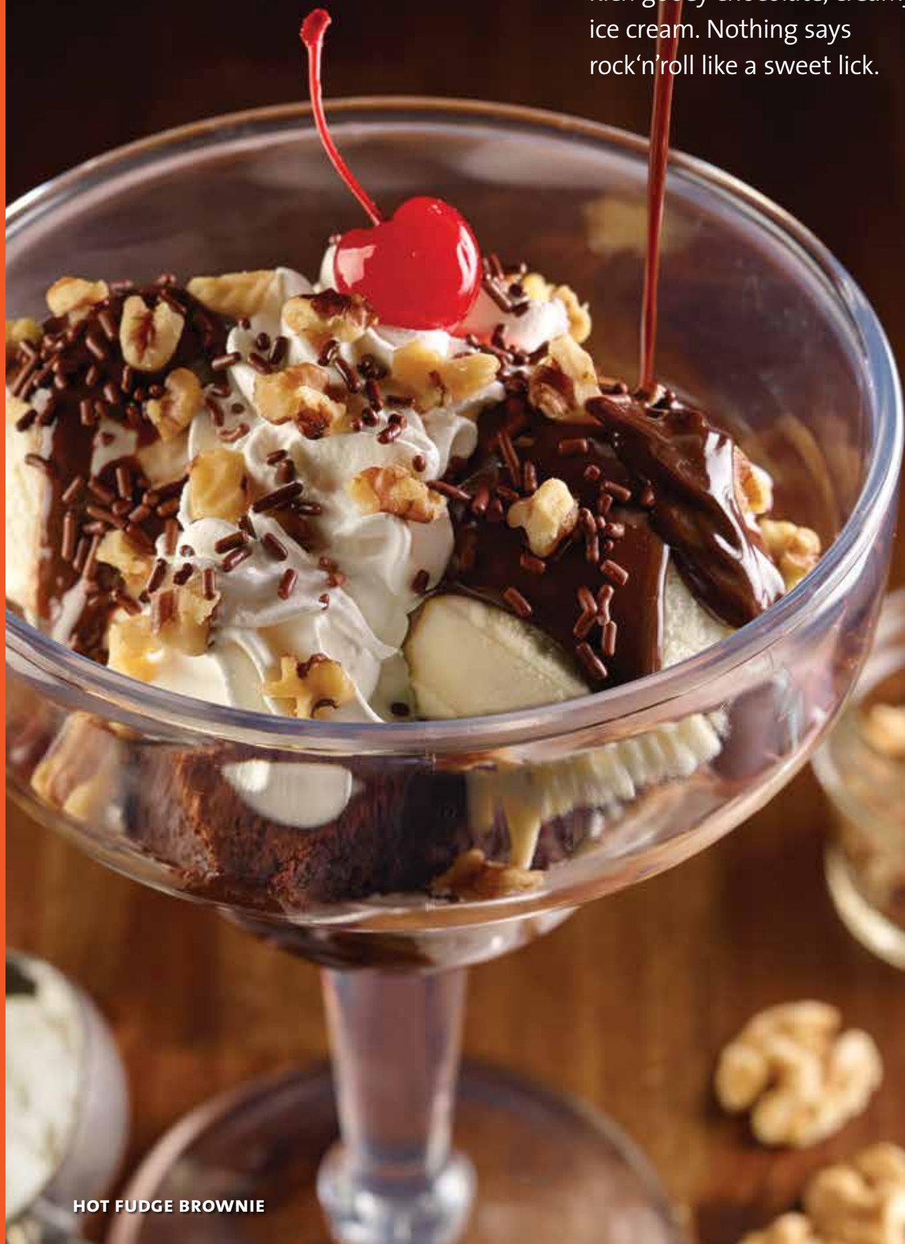
HOT FUDGE BROWNIE

Rich gooey chocolate, creamy ice cream. Nothing says rock'n'roll like a sweet lick.