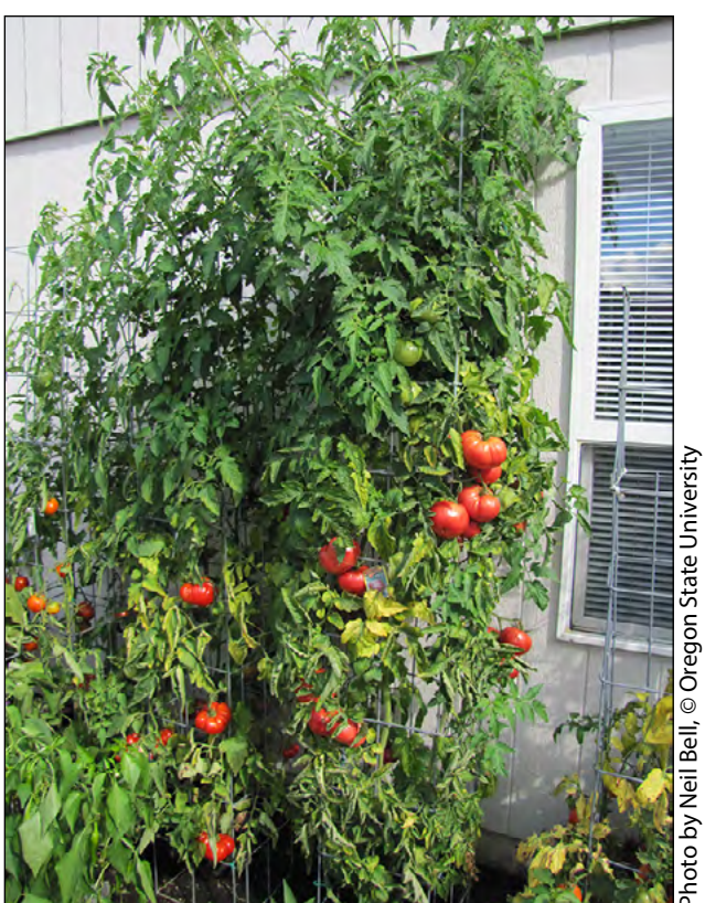
Trellised and pruned indeterminate tomato

The term "vine" is used for many tomato plants, but they are not capable of wrapping themselves around a trellis and, without support, they naturally sprawl across the ground. It is best to support your tomato plants with some sort of trellis to get the vine and fruit off the ground. This prevents fruit rot and damage from slugs and cutworms, increases air circulation, and makes harvesting easier. Trellised and pruned plants