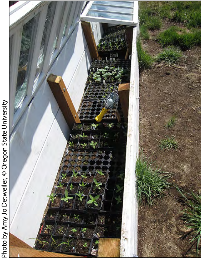
Propagating plants in a cold frame

An easy and inexpensive alternative to buying transplants is to propagate tomatoes from seed. It's often the only way to get plants of rare heirloom cultivars. You can grow plants from seed in a greenhouse, hot bed, cold frame, or window box. The best soil temperature for seed germination is 60 to 70°F. It takes from 5 to 8 weeks to produce good plants from seed, depending on the temperature.