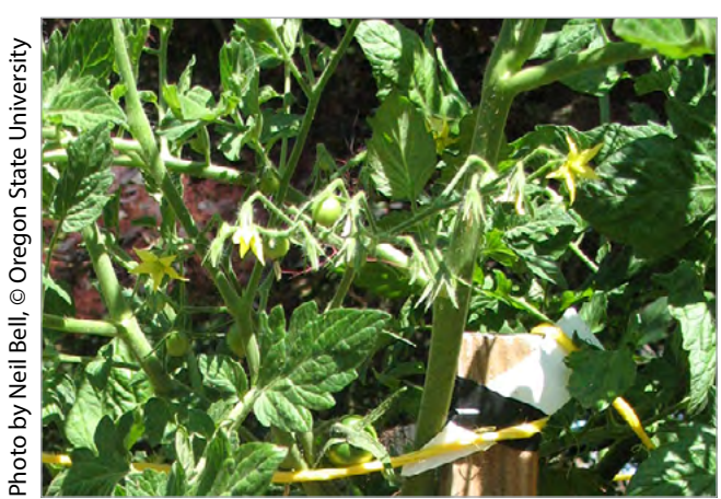
Tomato flower cluster

Semi-determinate tomatoes, especially beefsteak types, have a growth habit between that of indeterminate and determinate types. They produce vigorous lateral shoots that often terminate in a flowering truss (cluster). As a result, lateral shoots are not usually removed.