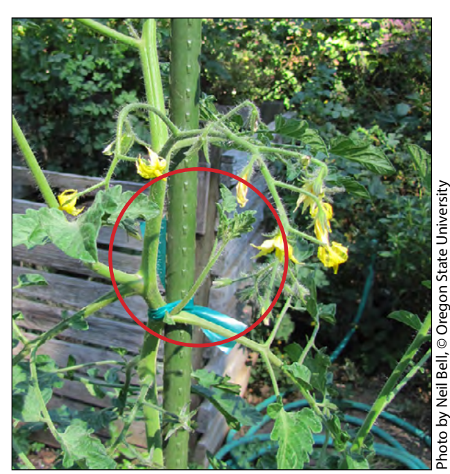
Remove the side shoots (also known as "suckers") in the leaf axils.

If you have allowed the plant to grow for a while without removing the side shoots, and they