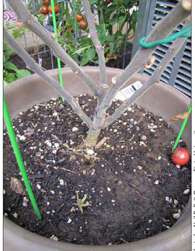
A grafted and pruned tomato plant, growing in a container

The real advantage of grafting to the home gardener is that it restores the yield of heirloom or other cultivars that lack resistance to diseases or pests. In one OSU study, grafted and seedling-grown 'Indigo Rose' plants were compared for yield. The grafted plants yielded three times as much as the seedling-grown plants. Grafted