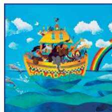
When the World Started Over Again Genesis 6–9