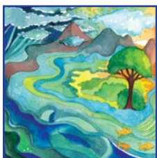
How God Made Everything Genesis 1:1–2:4a