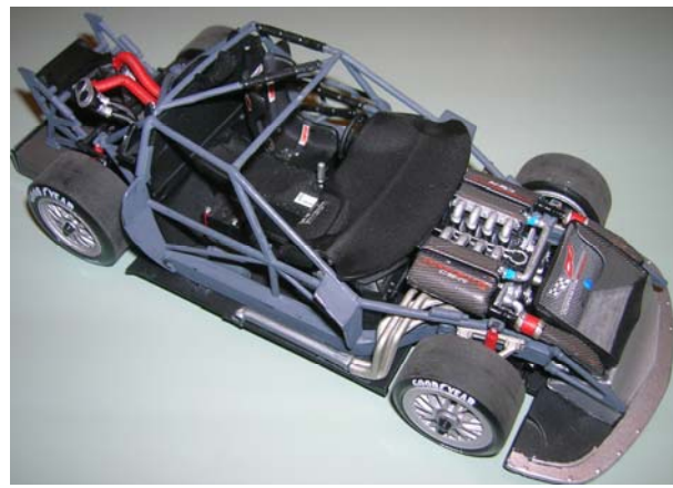
Dave Edgecomb: Ferrari 512 1/32 slot car by Fly, it came as a kit.