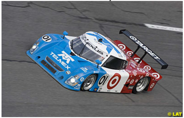
I still don't care for the Grand Am cars style, but it was an interesting race.