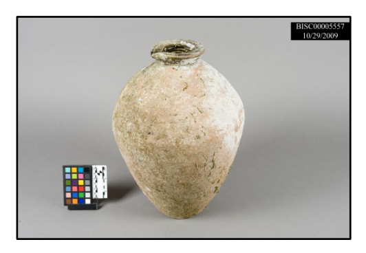
Figure 2: Museum Object Photograph

• Record the catalog number, negative roll number, and the frame number for all prints, transparencies, or negatives in a photograph log.