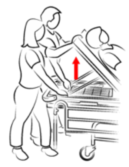
[REBA score 5] Figure 14. Two rescuers lowering a manual backrest on a trolley