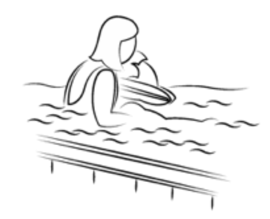
[REBA score 2] Figure 24. The rescuer has placed an inflatable support around the patient's neck

Position the board so that the head end is at the side of the pool.