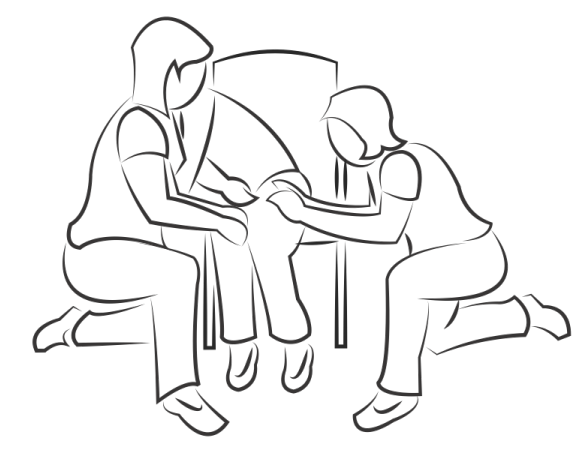
[REBA score 9] Figure 23. Alternative twoperson transfer from chair to floor

If a patient has a cardiorespiratory arrest whilst on a toilet they will be likely to fall either sideways or forwards. If the patient remains on the toilet transfer them on to the floor using one or a combination of the above techniques, depending on space constraints. Whilst transferring the patient on to the floor be sure to keep the door open. This will ensure that the entrance is not blocked and will allow other rescuers access to the room. During this transfer care should be taken to avoid trauma to the male genitalia.