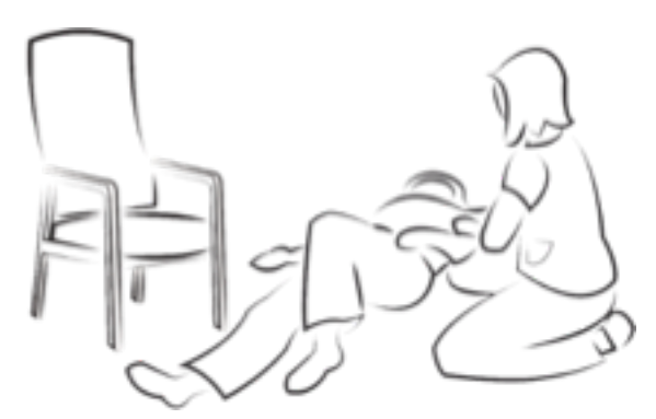
[REBA score 12] Figure 22. Position of the patient and rescuer on the floor