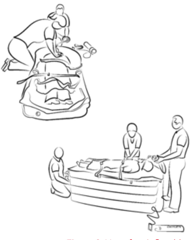
Figure 9. Use of an inflatable device to lift a patient from the floor to a bed or trolley

Try to keep the patient horizontal. A headdown position increases the risk of gastrooesophageal regurgitation and makes ventilation more difficult.